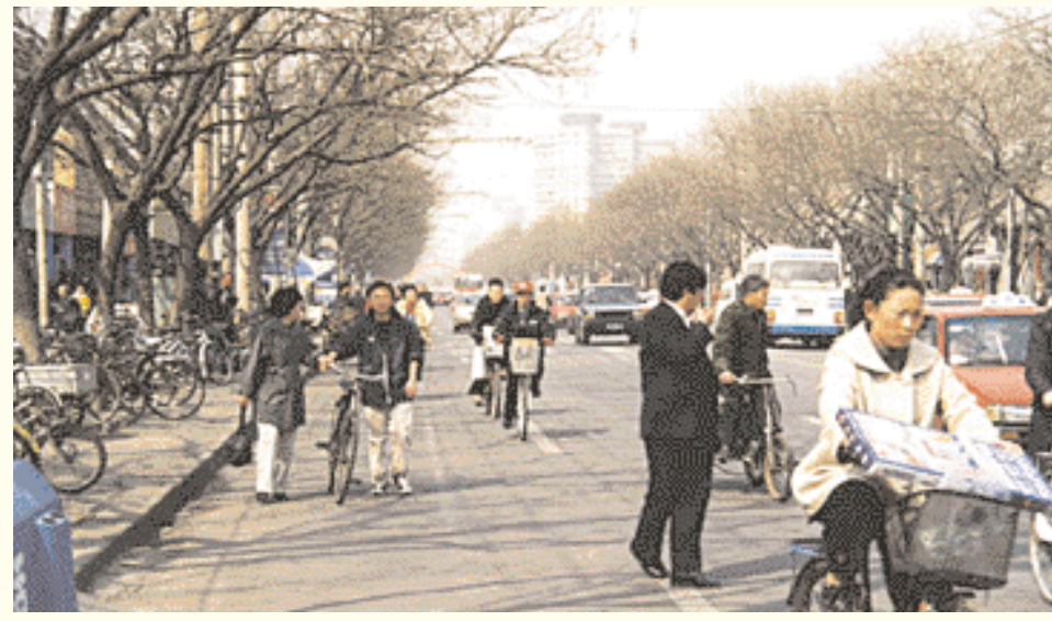
Daily life in Beijing

The stores, with simple folding screens, are open from 8 a.m. to 10 p.m. The shopkeepers are not concerned about theft - Beijing is a city where safety reigns. And security men are on hand after the shops have closed.