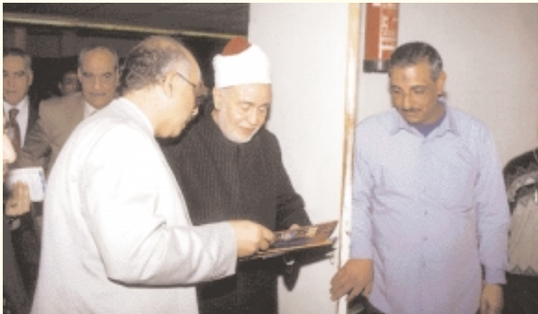
Dr. Tantaoui, the Imam of Al-Azhar, with our representative

Last month, the Egyptian Ministry of Tourism organized a conference: "Tourism in Egypt from an Islamic and Economic Point of View", in collaboration with Al-Azhar University. The conference was held in the university's congress hall.