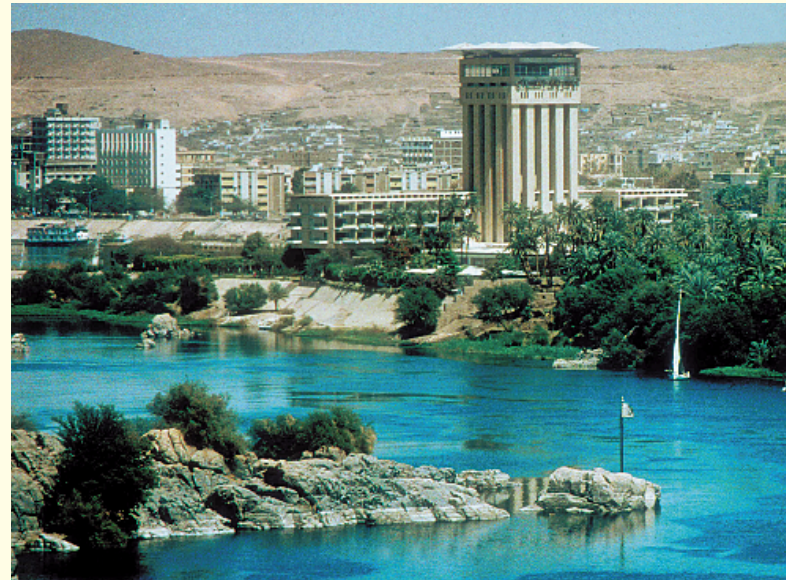
Nile and Oberol Hotel