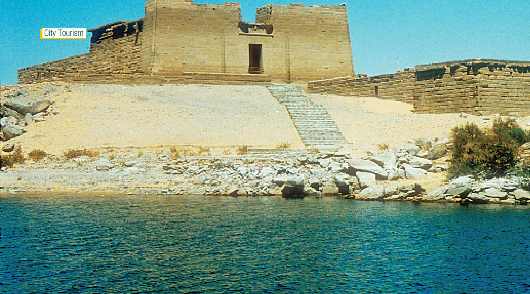
Kalabsha Temple on Nasser lake