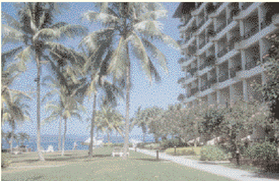
Shangri-La Tanjung Aru Hotel.

Sabah, part of Malaysian Borneo, offers new interests and a touch of excitement with opportunities for rain forest trekking, white water rafting and climbing 14,000 ft Mount Kinabalu, - the highest mountain in South East Asia. Floral colours in hotels, streets and parks are eye catching.