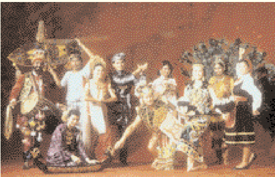
A Cultural Melting Pot.