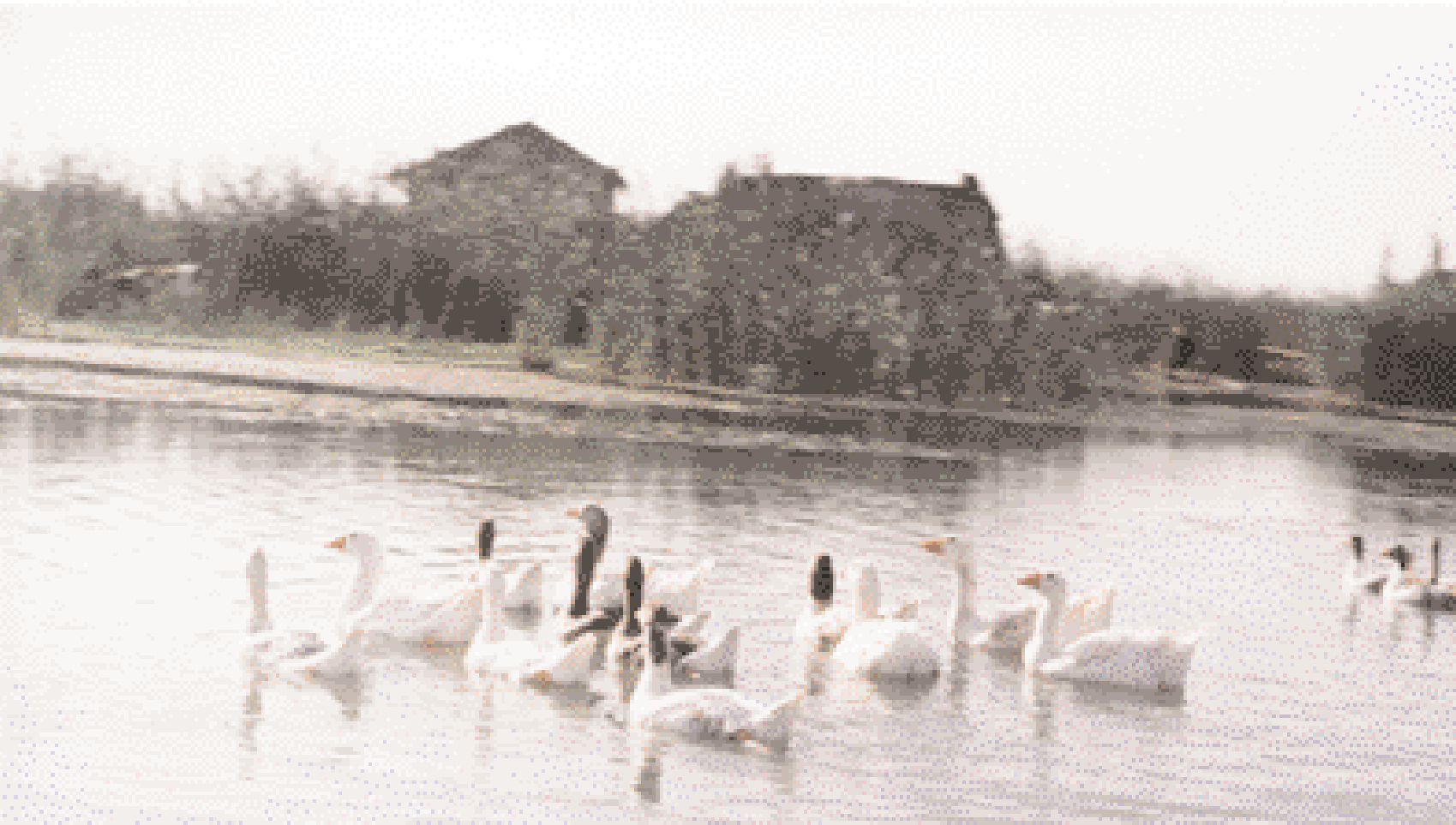
سرب من البط داخل هور الجبايش.

The rejuvenation project is expected to take about five years and Iraq will see Eden again. ■