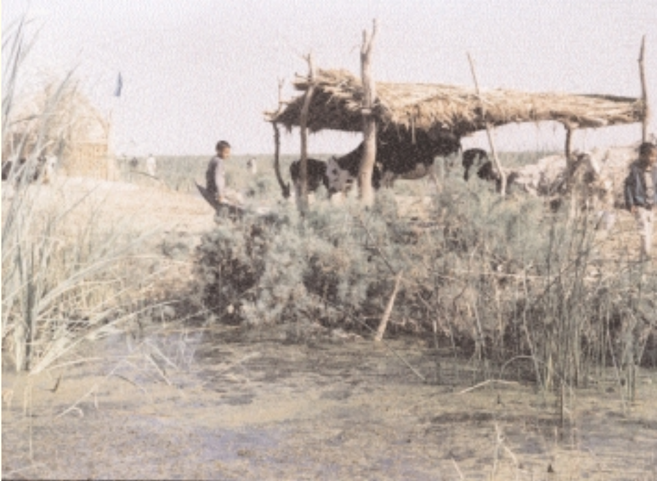
A house in the marshes.