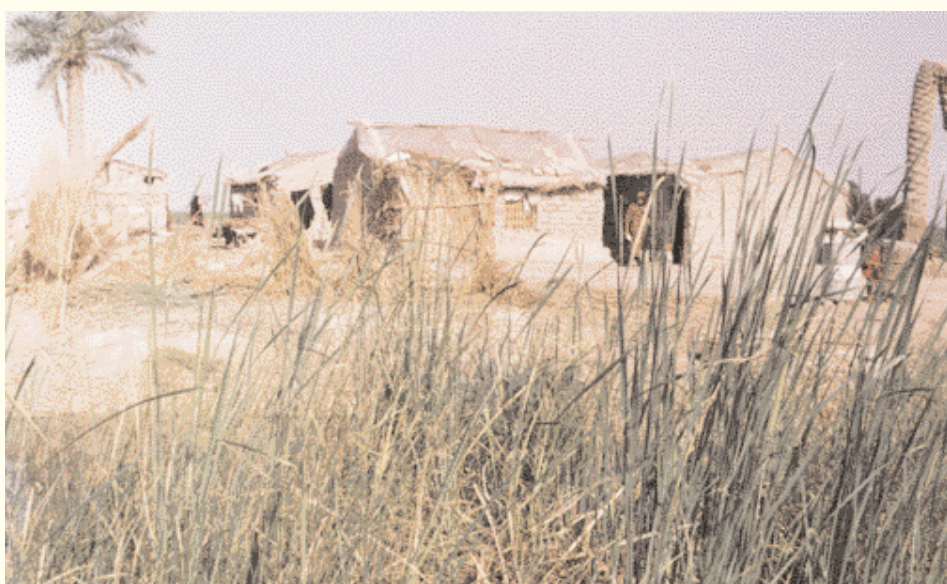
Houses in the deep marshes.