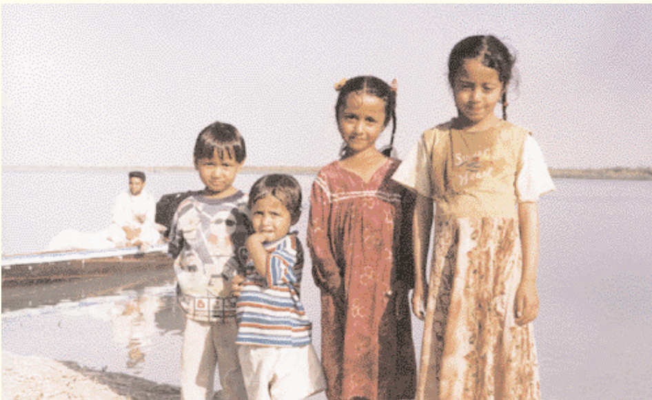
Children in the marshes.