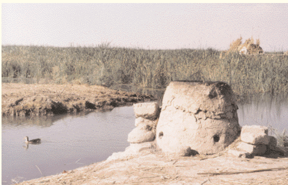
The clay oven for cooking bread.