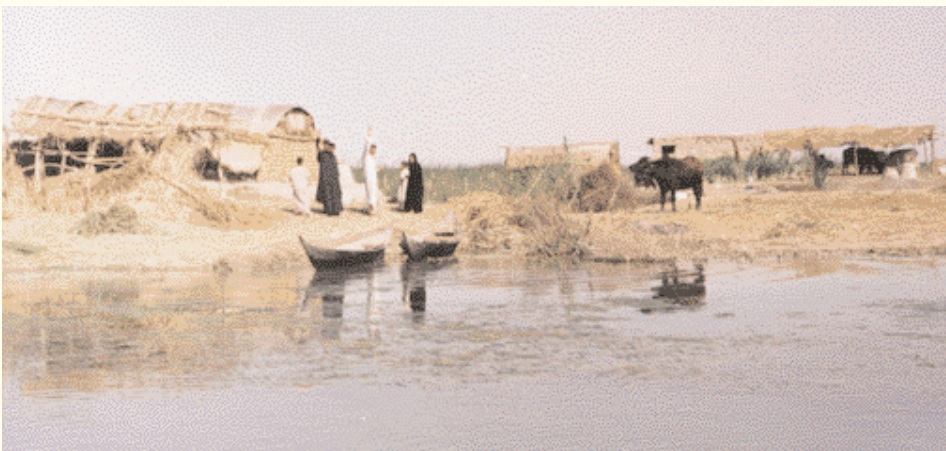
The cattle live with their owners.