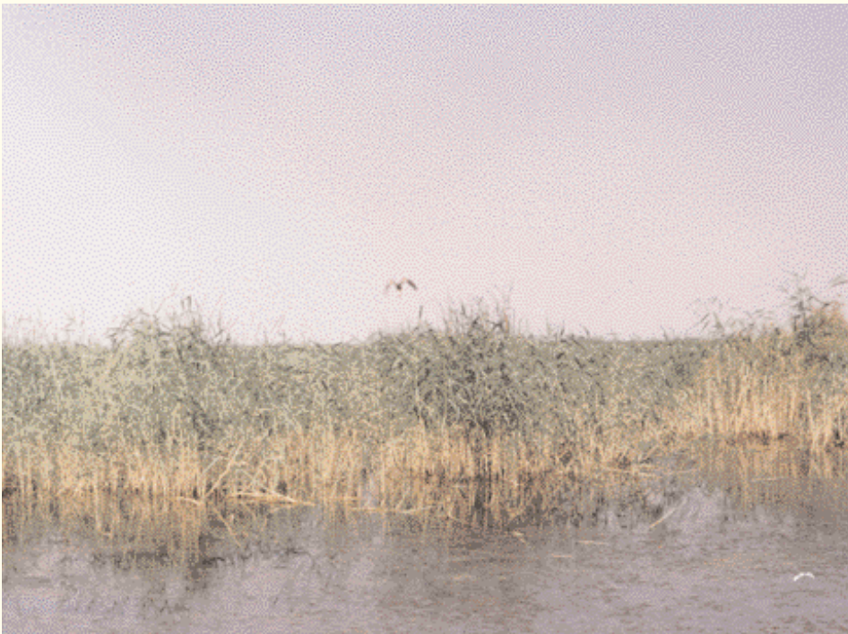
View of the marshes.