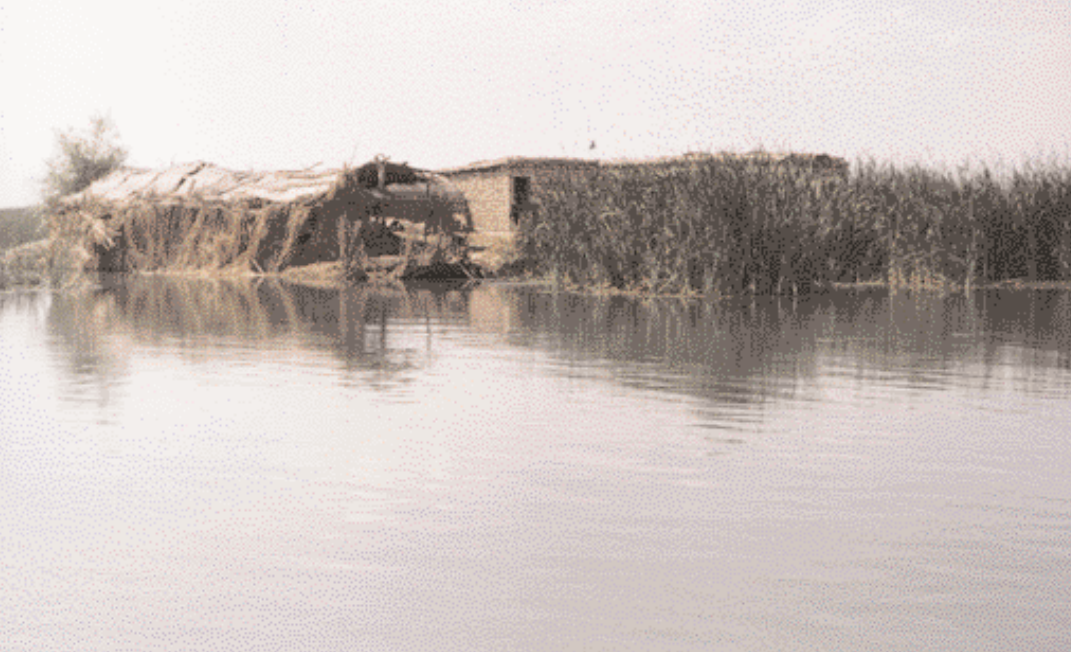
The animals live with their owners.