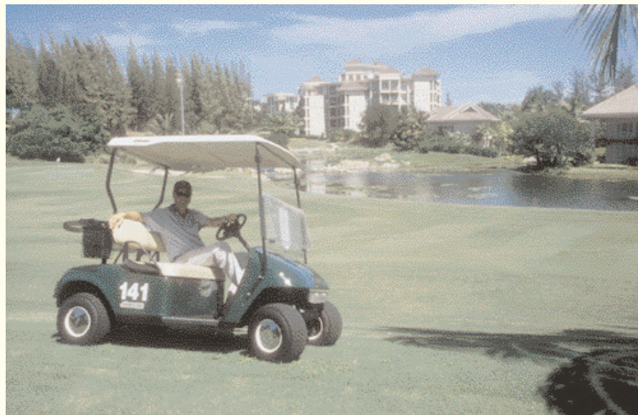
Empire Hotel- Golf Club.