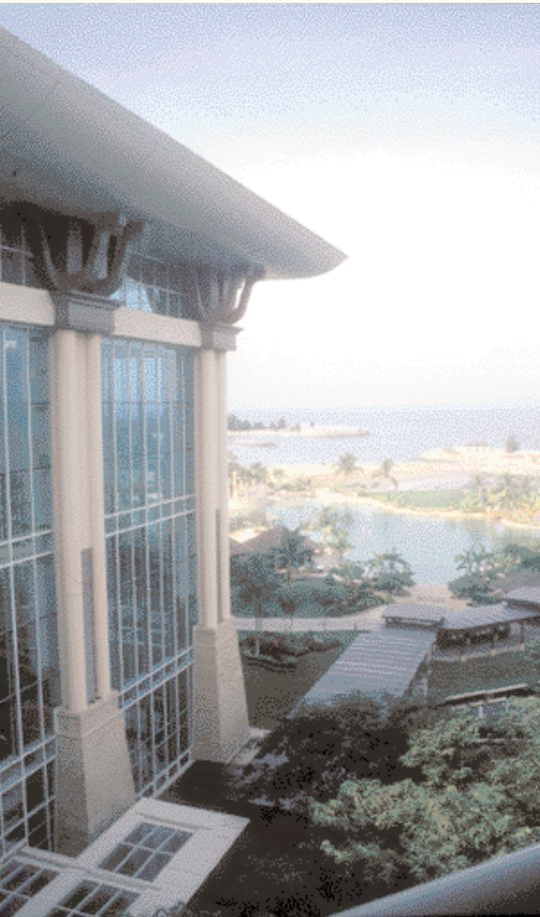
Empire Hotel and Country Club.