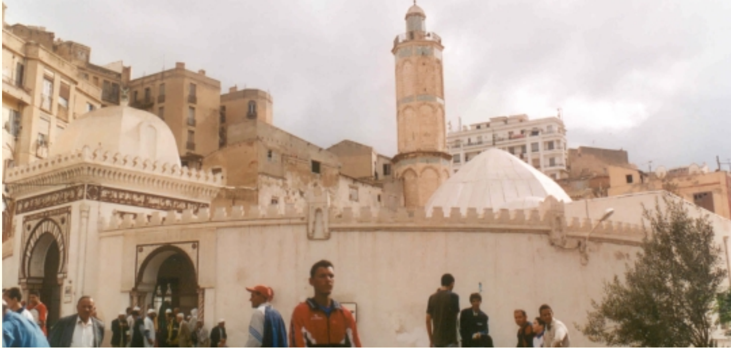
Al Bacha mosque