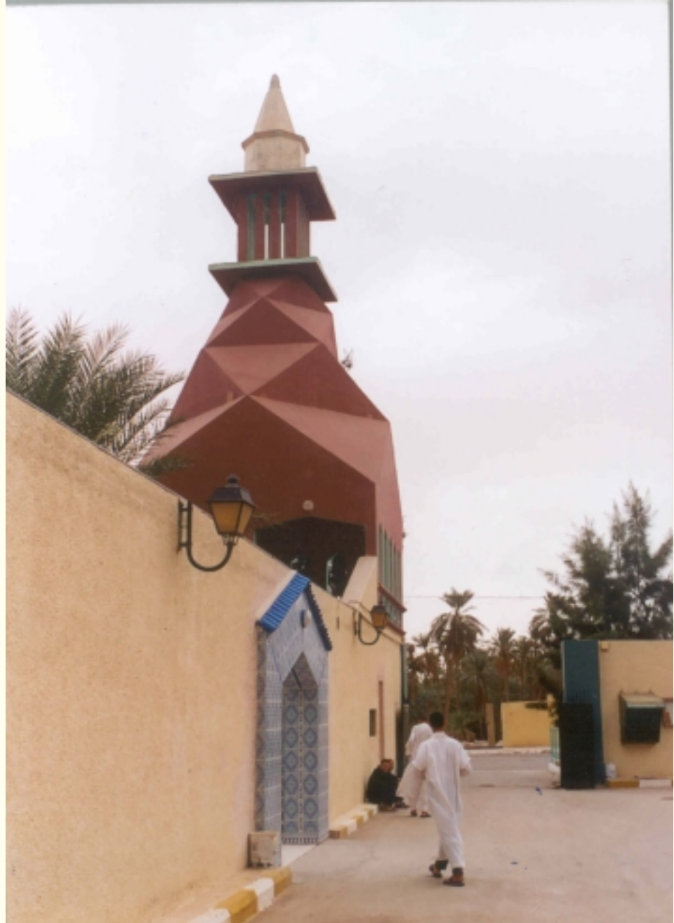
The Minaret of the Ottoman Zouia- Biskra

Algeria is currently witnessing a tourist renaissance supported by the state and all its departments. The visit of the "Islamic Tourism" delegation to Algeria came after an invitation from the Minister of the Tourism Mohamed Saghir Karah, who since his appointment, didn't stop participating in