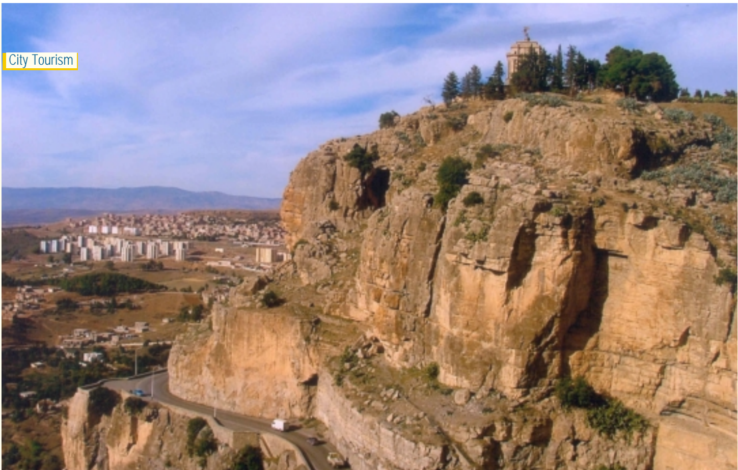
On the road to Biskra