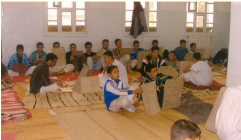
Learning Koran at the Ottoman Zouia

إمام مسجد عقبة بن نافع ومندوب المجلة في زيارة لضريح سيدي عقبة