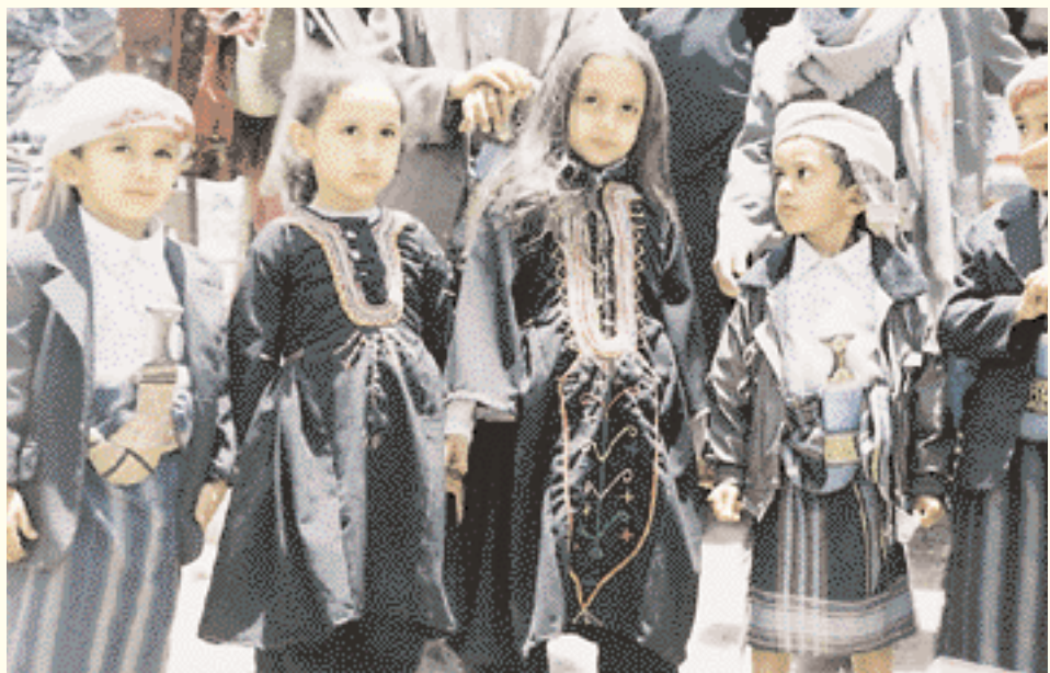
Folkloric costume in Ibb Festival.

عرض فلكلوري للأزياء الشعبية في محافظة إب.