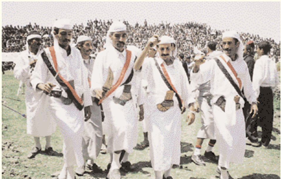
Folkloric dance in Ibb Festival.