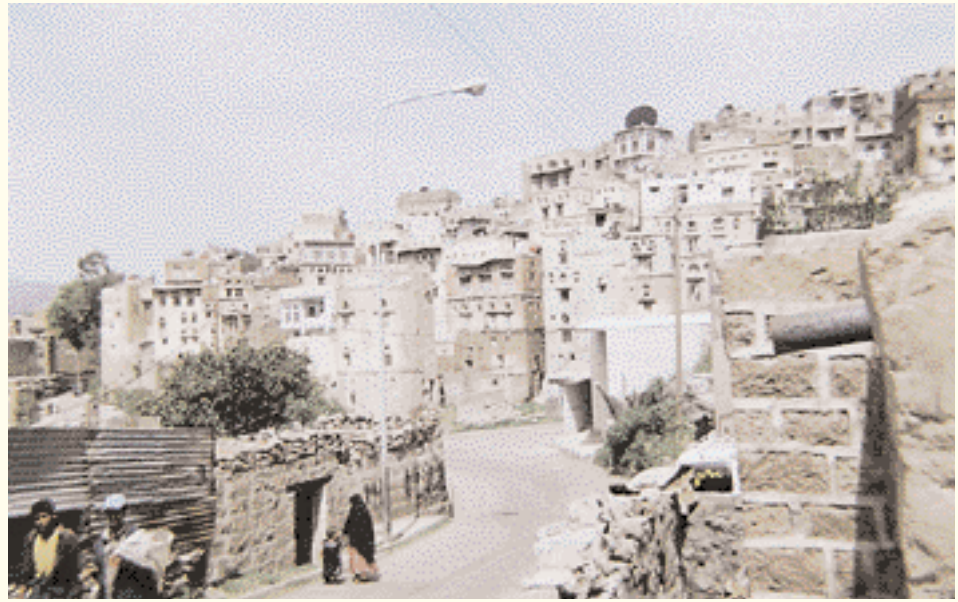
The Eastern entrance of Ibb.

The tourists who attended were delighted by the natural beauty and cultural heritage of the region. A number of investors also expressed a willingness to invest in the tourism sector. The festival was well covered by satellite television and Islamic Tourism magazine was awarded a certificate for its participation by the governor of Ibb and its counsel. ■