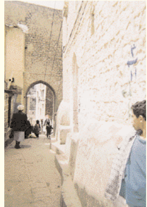
Old door in Ibb.