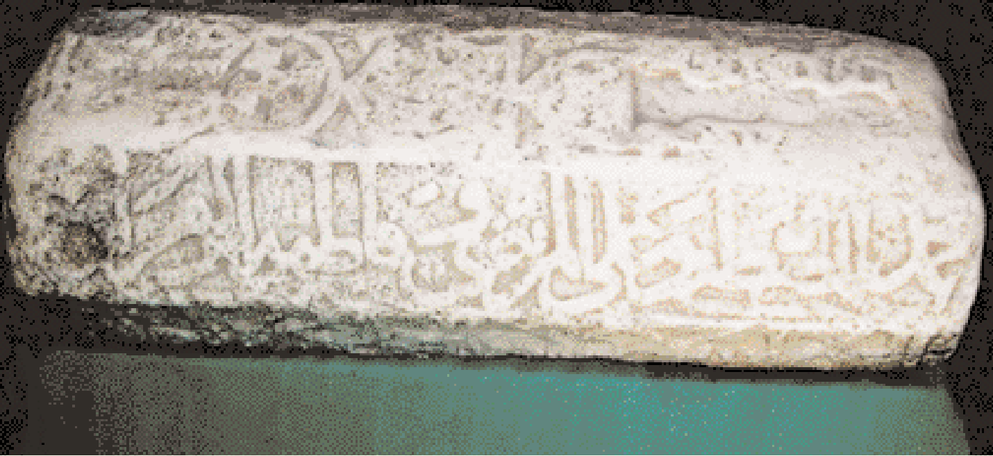
The white stone of Baratha.