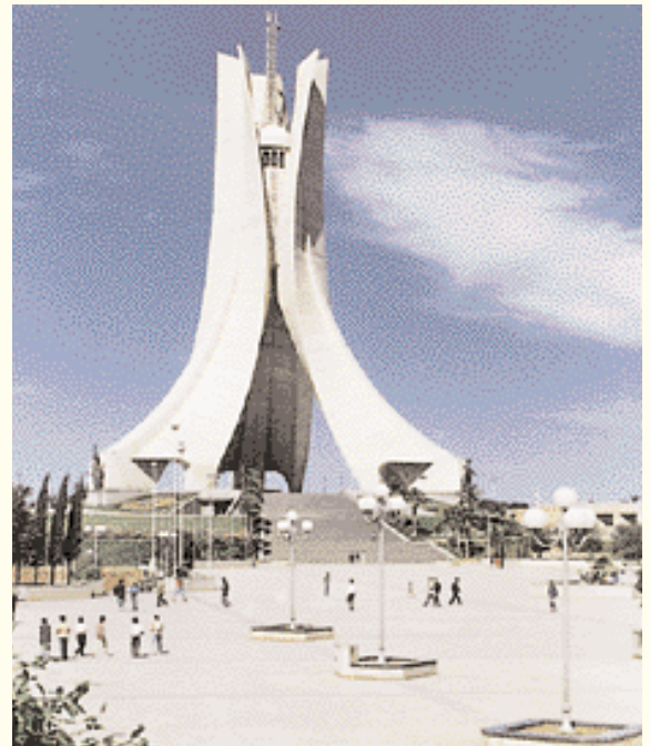
The Martyr's Monument, Algiers. نصب الشهيد، الجزائر.