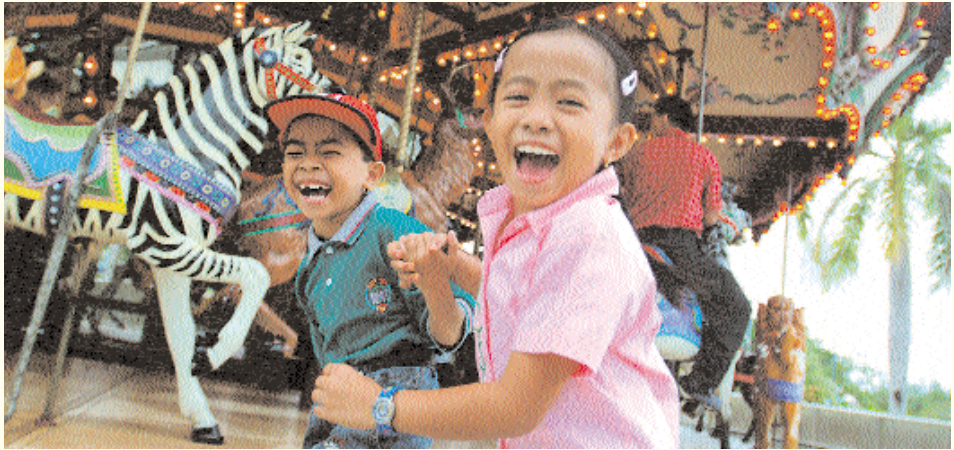
There is plenty of amusement for the children.