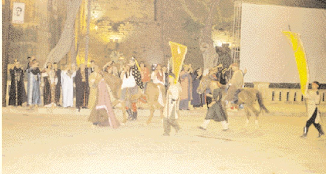
The arrival of the caravans.