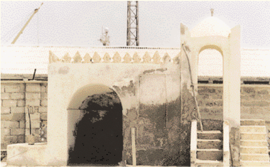
مسجد الصحابة المهاجرين برأس مدر في ميناء مصوع .

The mosque of the Companions of the Prophet at Massawa.