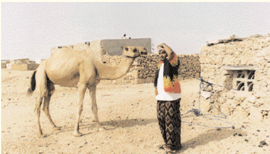
One man and his camel in Dahlak Kabir.

The Caliphs mosque, which was built in 1900, lies close to the centre of Asmara. In front of the mosque is a spacious yard where some people pray on mats and wickers. This extremely popular mosque is surrounded by the most important markets of Asmara: the basket market, the spice market and the fruit and vegetable market. This is in addition to shops selling clothes, handicrafts, appliances etc. The palace of the governor Ferdinando Martini, built in 1905 and the Theatre of Asmara, are eye-catching landmarks. Distinguished ➤