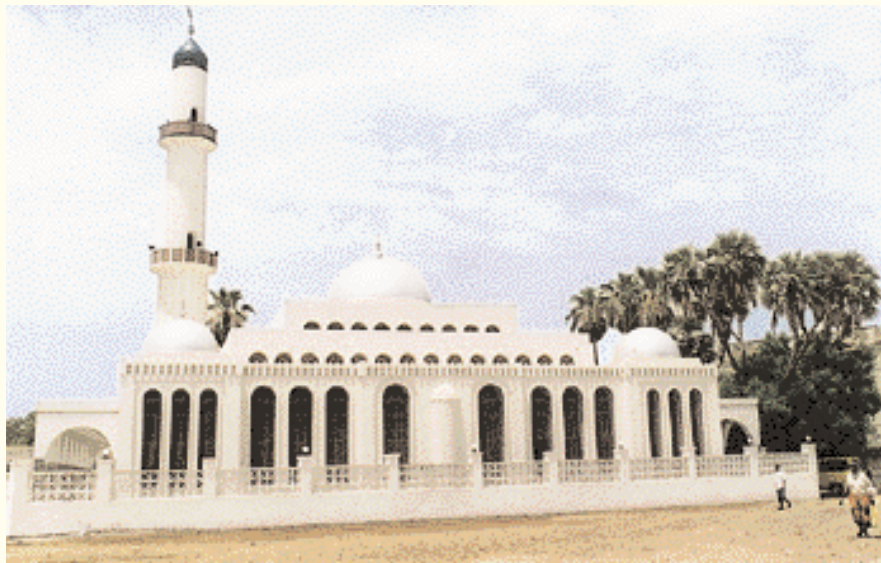
Imam Abu Hanifa Mosque in Massawa.