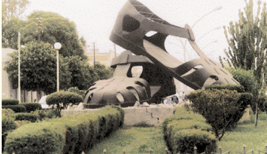
نموذج ضخم للصندل البلاستيكي "رمز الكفاح" بميدان الشهداء وسط أسمرا.

Asmara is known as the 'City of Flowers' because of the abundant jacarandas and bajophlias. The popularity of the gardens and florists could have come from the influence of the Italian colonisers (1890-1941). The legacy