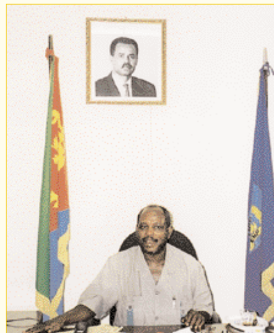
اللواء حُمدٌ محمدٌ كاريكاري قائد القوات البحرية الإرتيرية.