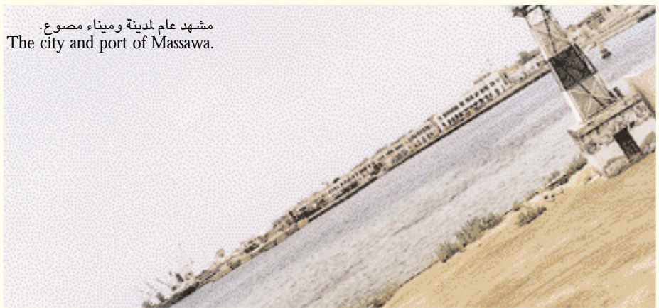
مشهد عام لمدينة وميناء مصوع. The city and port of Massawa.