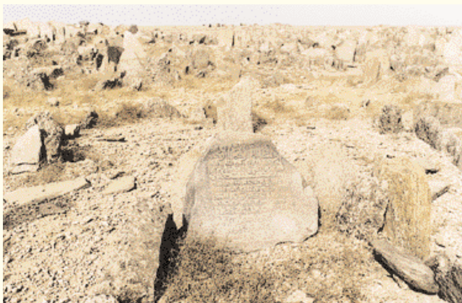
The graveyard of the Persian Muslims in Dahlak Kabir. مقابر المسلمين الفرس في جزيرة "دهلك كبير".