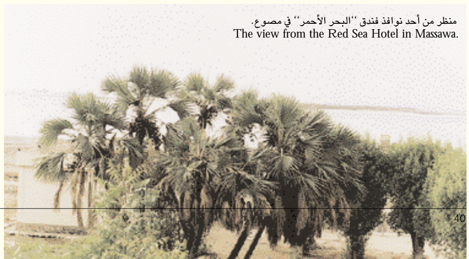
منظر من أحد نوافذ فندق "البحر الأحمر" في مصوع . The view from the Red Sea Hotel in Massawa.

Towards the end of our visit we had a wonderful impression of Eritrea and predicted a prosperous future for this beautiful country. That is when we asked a crucial question: What is the point of having a beautiful country with tremendous tourist potential if these attractions are not given the maximum publicity in the ➤