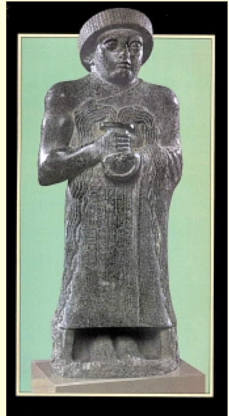
حاكم لجش السومري جوديه. Gudea, pious ruler of Lagash.

Babylon became the most famous city in the Ancient World, and a wonder therein, after attaining the summit in its expansion at the hands of the Babylonian King Nebuchadnezzar. Its reputation dominated, so that it became a symbol of the civilization of Ancient Iraq, and the country was consequently named Babylonia after Babylon. Its city walls and Hanging Gardens were considered to be one of the 'Seven Wonders of the Ancient World', and Aristotle deemed Babylon a wonder in its greatness and spaciousness. The city of Babylon began as a small village; developing into a town towards the end of the third Millennium B.C. and then further evolving until it became the capital of the first and second Babylonian empires. During the rule of Nebuchadnezzar its expanse was approximately 10 Km square and its perimeter 18 Km, contrasted to the area of Nineveh, the capital of the Assyrians which was 7.4 Km square and its perimeter 9 Km,