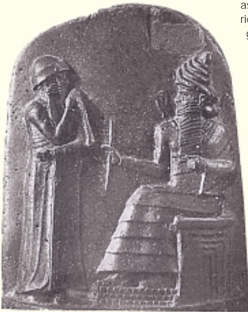
الجزء العلوي من مسلة حمراي. Upper part of the stele.

He thereupon proceeded with his conquests to the Mediterranean and Asia Minor. During the Akkadian period, great advancement in architecture and art became evident; the arts in general were characterized by energy, vitality and action.