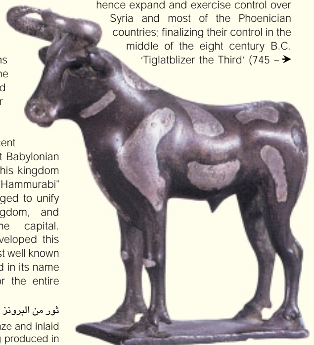
ثور من البرونز المطعم بالفضة من نتاج السومريين.

A bull from cast of bronze and inlaid with silver, were being produced in southern Mesopotamia.