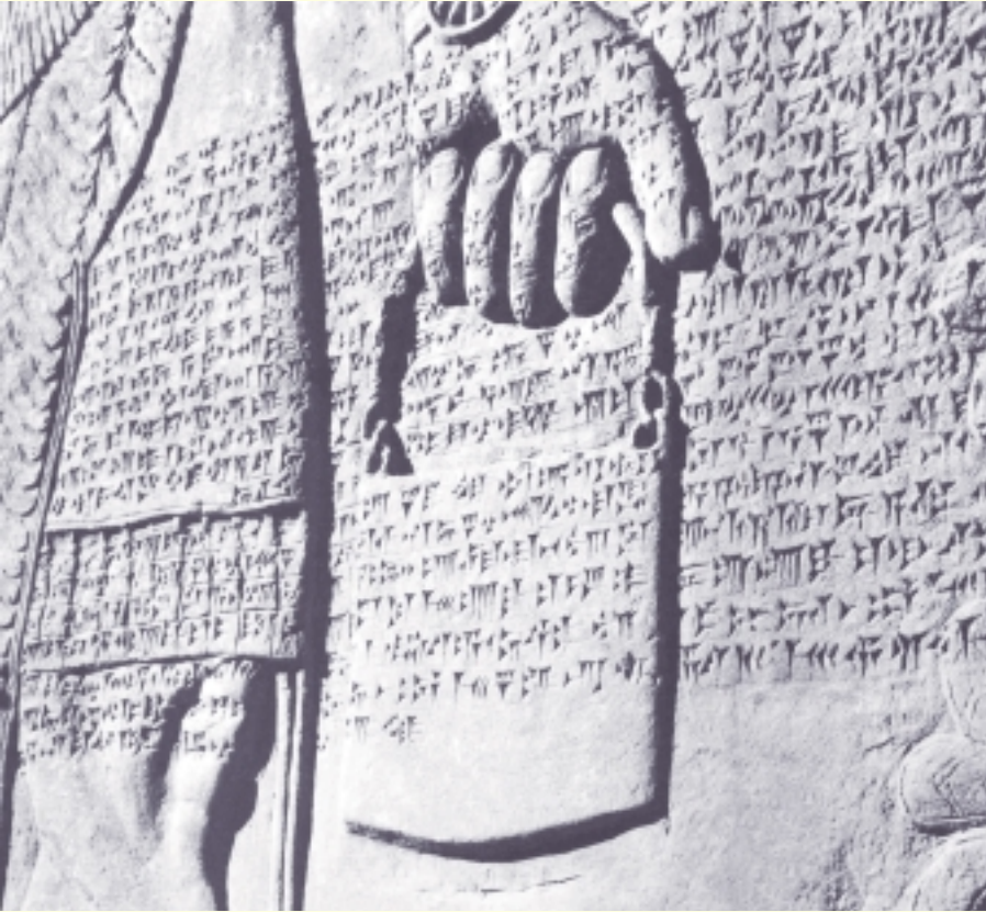
Specimen of Assyrian writing.

The dawn of civilization began in Mesopotamia towards the end of the Sixth Millennium B.C., and ended in the last quarter of the Fourth Millennium B.C. During this time, as we have previously mentioned, the country witnessed the birth of writing, the evolution of the first city in history, the expansion of agriculture, as well as the development of the art of mining, and the advancement in industries such as the production of clay baked bricks.