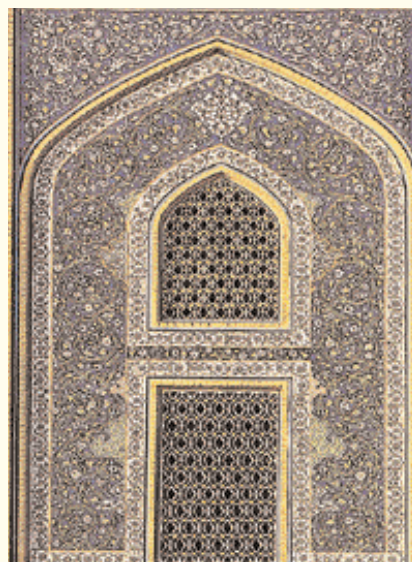
زخارف بديعة في أحد مساجد اصفهان. Arabesque in a mosque in Esfahan.

The Opening Ceremony of the Congress began with a recitation from the Holy Qur'an and was followed with an address by Ahmad Masjed Jamee, Minister of Culture and Islamic Guidance. He emphasized the importance of the Congress as an opportunity for further cooperation among concerned authorities and institutions working in the field of Islamic arts and crafts, concluding his address by calling for more