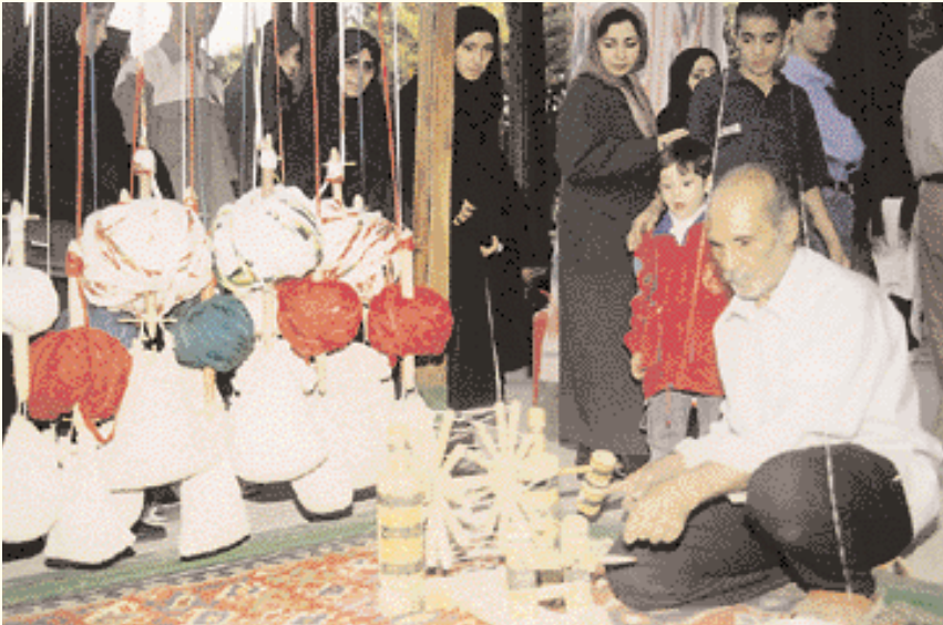
حرفي إيراني يعرض مهاراته.

An Iranian craftsman demonstrates his skills.