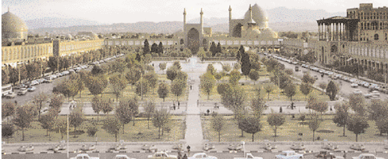
Naqsh Jahan Square (Imam Square)