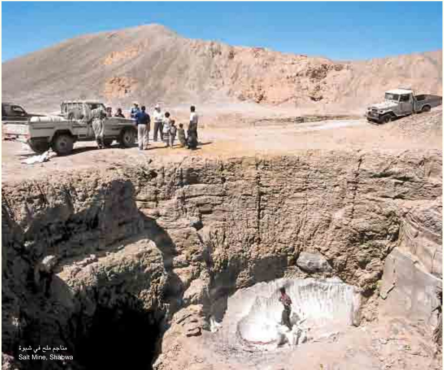
مناجم ملح في شبوة Salt Mine, Shabwa

Shibam is remarkable for its mud skyscrapers that appear out of nowhere on ➤