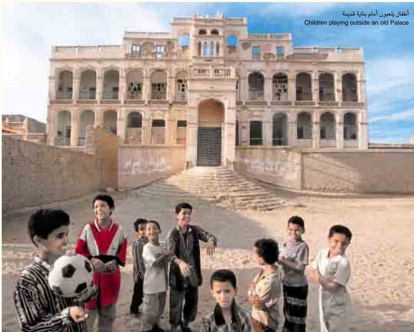
أطفال يلعبون أمام بناية قديمة Children playing outside an old Palace

An early morning departure from Sana'a' via Aden to London. ■