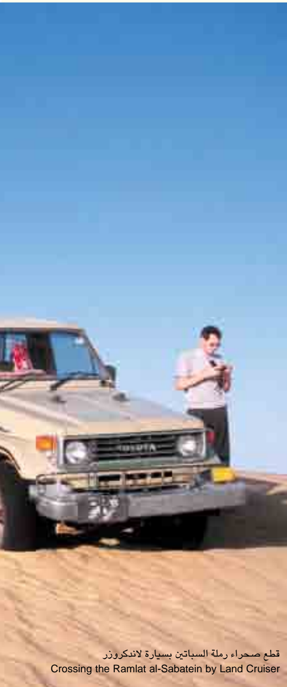
قطع صحراء رملة السباتين بسيارة لاندكروزر Crossing the Ramlat al-Sabatein by Land Cruiser

than 1,000 years and there are palaces dating from the 13th century. In the city, the traditional houses have the most intricate carved wooden doors, miniature examples of which are available to buy from the many tourist shops in town (most of which opened up when they saw us ➤