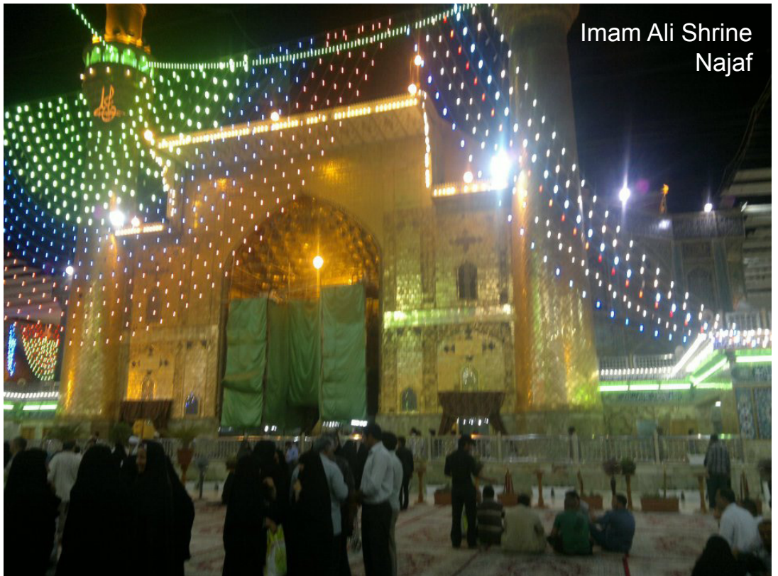
Imam Ali Shrine Najaf

Qatar Airways Chief Executive Officer Akbar Al Baker said he was