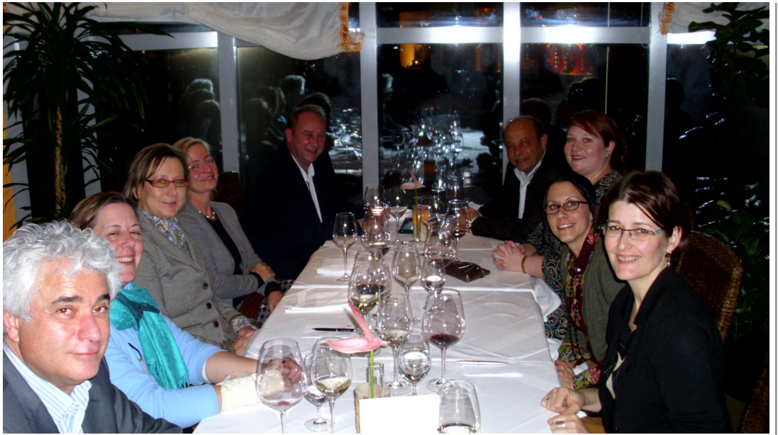
Jouranlist Group having dinner at Kempinski Budapest