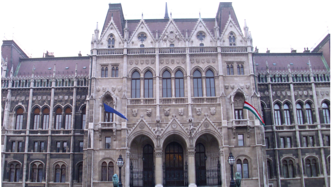
Historical Buildings and Bridges in Budapest

With direct connections to most of the metropolitan areas in Europe, and with good connections to Middle East and North America through the new terminal at Budapest Airport, Budapest city welcomes delegates from all over the world to hold their meetings, events, and conventions.