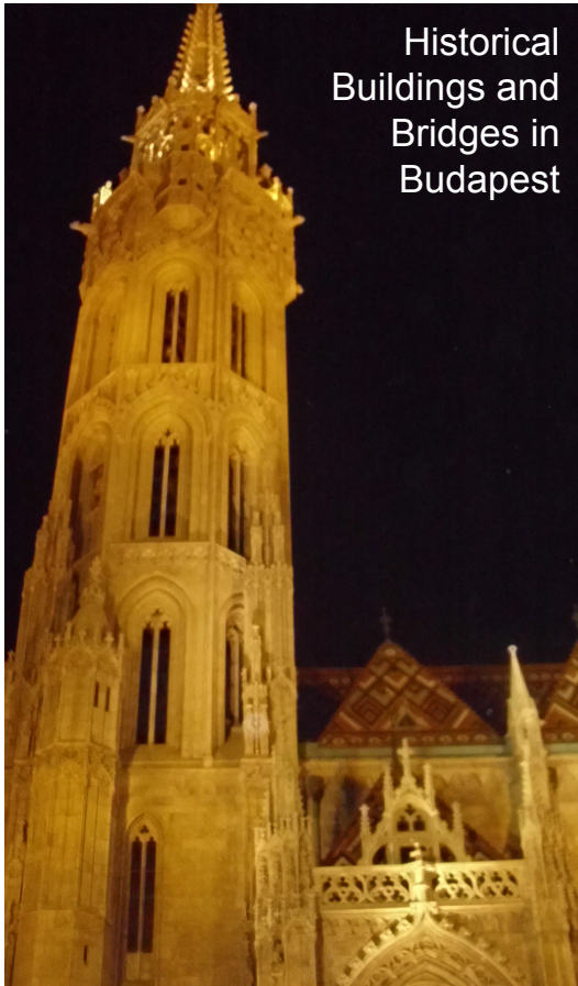
Historical Buildings and Bridges in Budapest