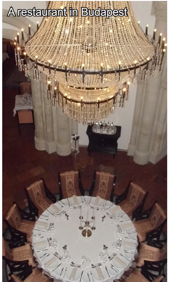
A restaurant in Budapest