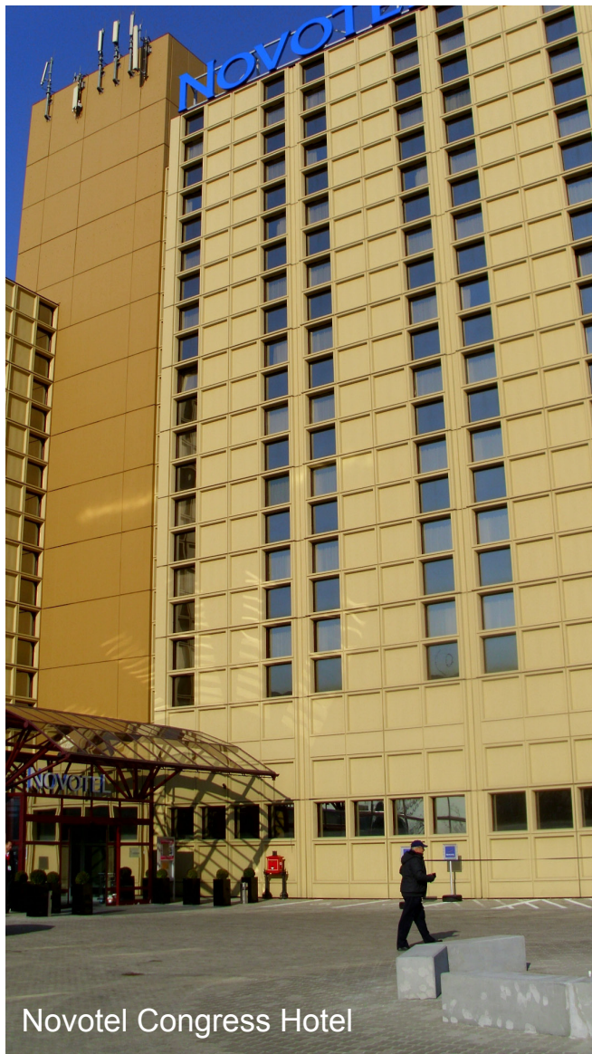
Novotel Congress Hotel