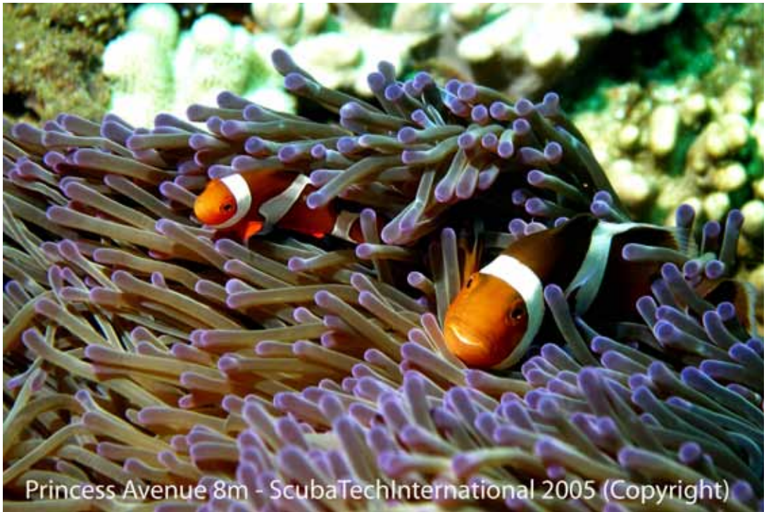
Princess Avenue 8m