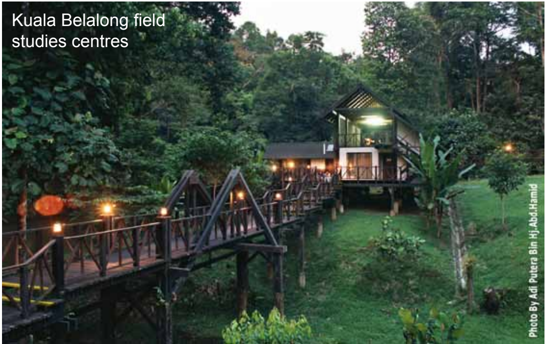
Kuala Belalong field studies centres