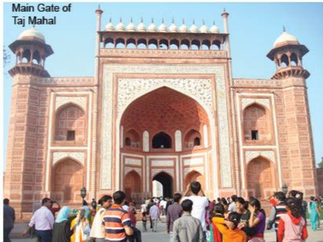
Main Gate of Taj Mahal

Sometimes ,one feels bored as soon as his feet touch the ground : other times , one is very happy on arrival . When landing on the Taj