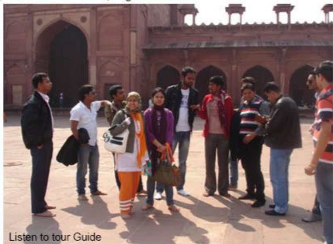
Listen to tour Guide

My strongest memories are of the welcoming , smiling ,friendly Indian people who meet you in Taj Mahal so this place will be your next of tourism destinations in future .