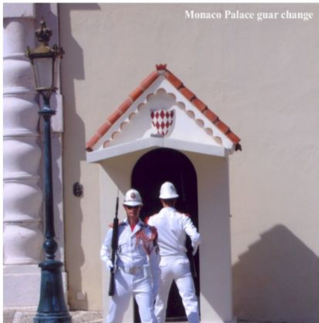
Monaco Palace guard change

But if there's a more magnificent port to enter, I'd love to see it.