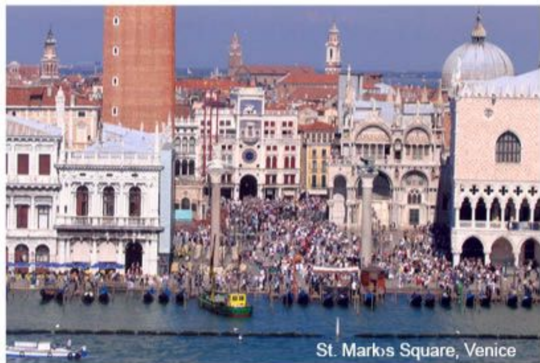
St. Mark's Square, Venice

Much the same for the Greek island of Corfu. At Spianda Square in the town center there were more