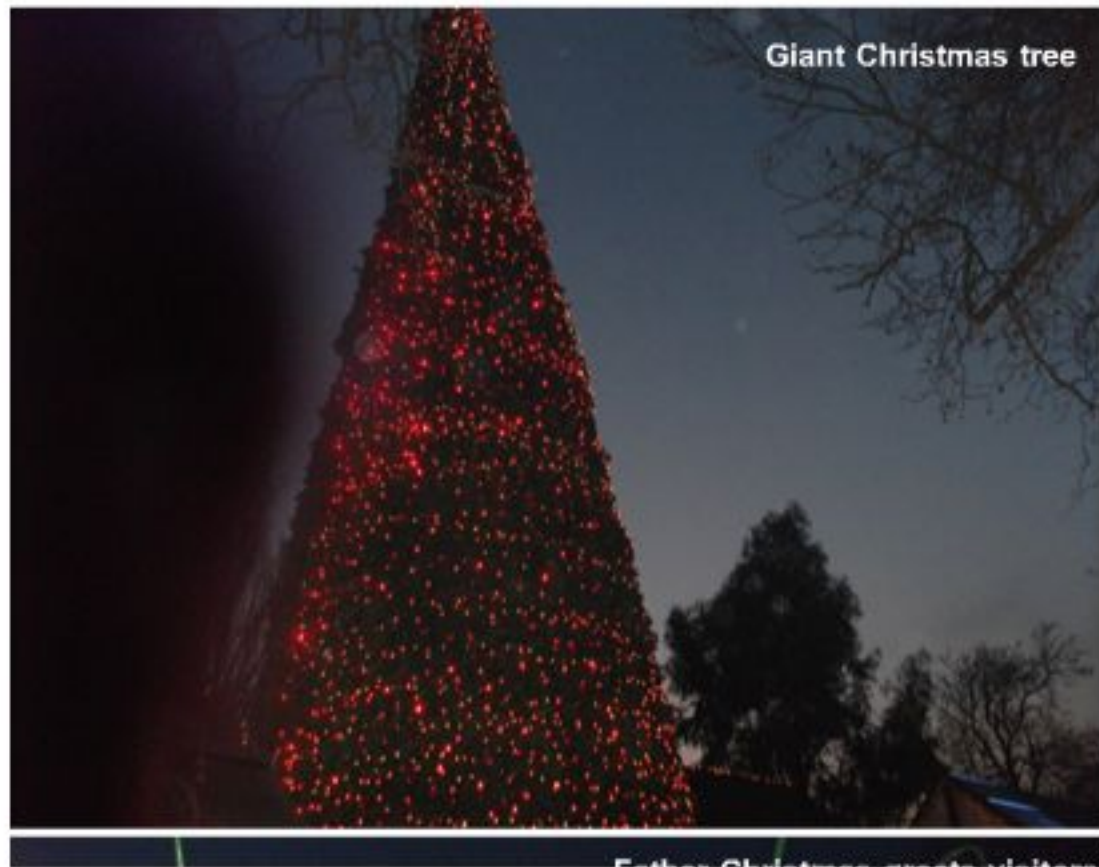
Giant Christmas tree

Westbourne Park Family Centre, in West London, which runs pre-school groups, a toy library, parent support club, after school clubs and activities for 519- year olds from the Westbourne and Paddington wards, is one of the lucky projects who will benefit from these funds.