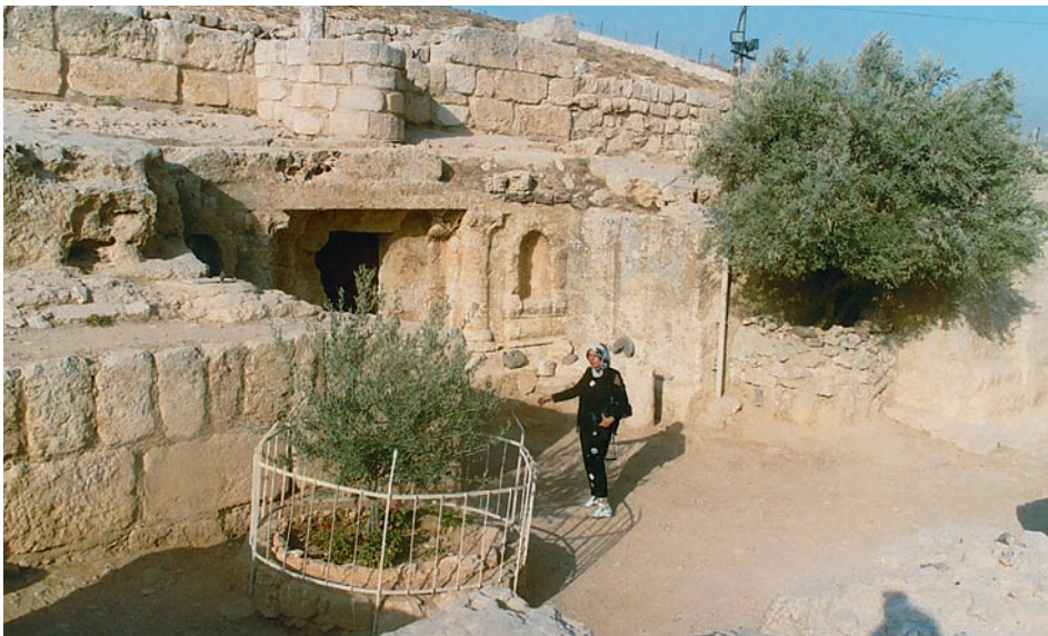
The cave and surrounding area

and Denzel Fisher. It has an entrance decorated by two columns, and an opening in the ceiling, of three arcades where the tombs of the people of the cave are found. Their bones were gathered in one tomb, after the theft of the bones of the dog in 2004. To the right of the cave entrance, one can see the tombs and the opening in the ceiling. Opposite, there are remains of Byzantine utensils, displayed in a glass cupboard. ■