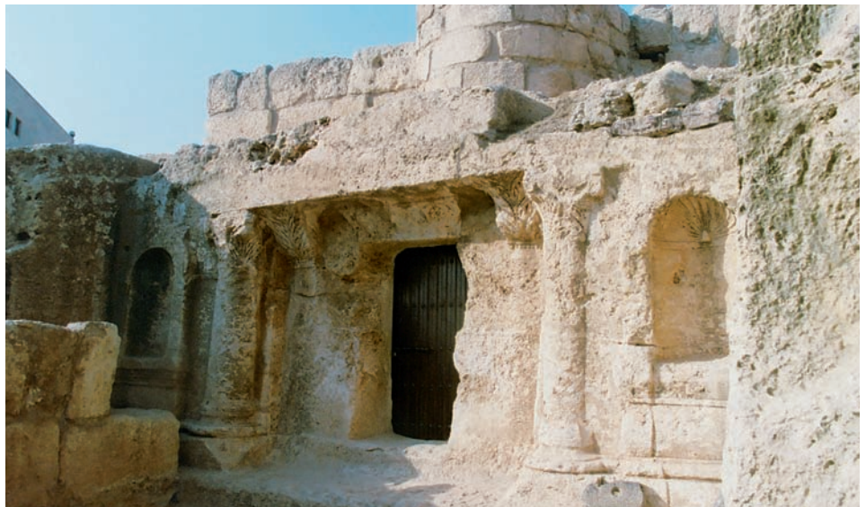
The cave's door

When I visited the site, I found a mosque which was built above the cave on the ruins of an old Byzantine church. I also