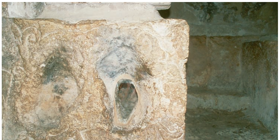
Inside the cave