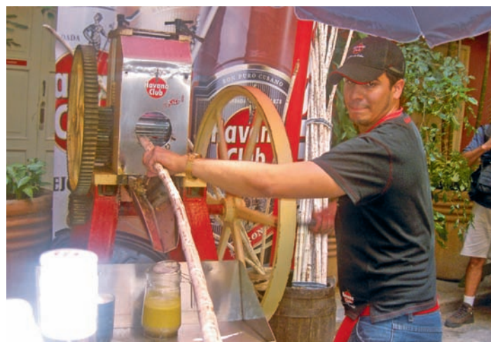
Pressing sugar cane for juice