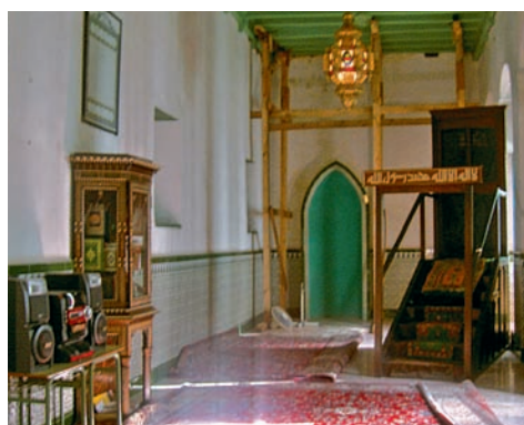
Casa Arabe-Inside the mosque البيت العربي-داخل المسجد