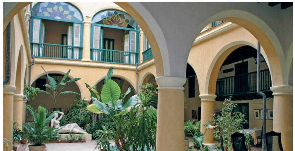
House courtyard on Arabic style