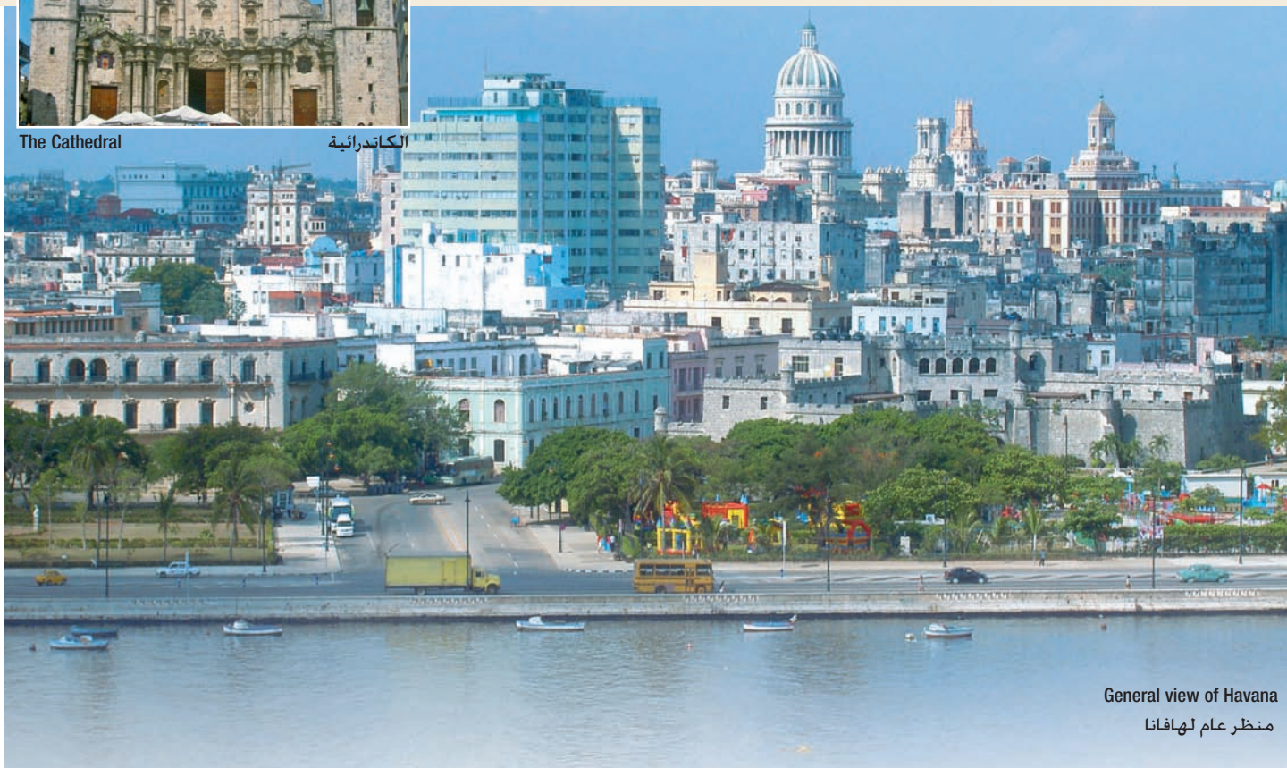
General view of Havana

To fully discover Havana both old and new, we decided to explore the city in two stages. In the morning, we would explore the new part by auto and in the afternoon roam through the old section on foot. I had visited Havana numerous times before, but I had not truly discovered the city. This time it was going to be different.