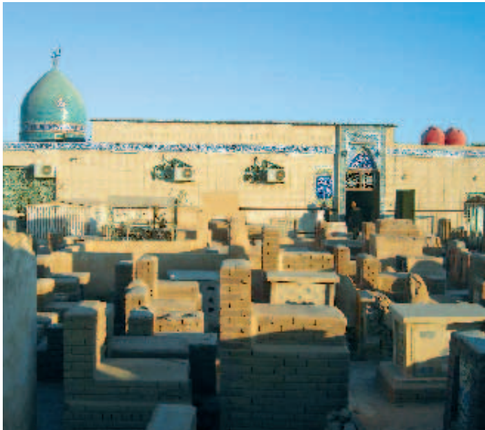
The graveyard around the shrines of Hod and Saleh المقبرة المحيطة بمقعد النبيين هود وصالح