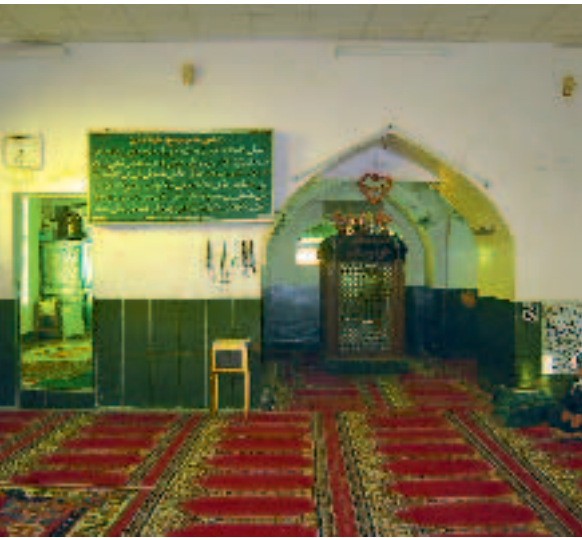
The mausoleums of Hod and Saleh مرقد النبيين هود وصالح

Al-Uloum. The building of mausoleums followed.