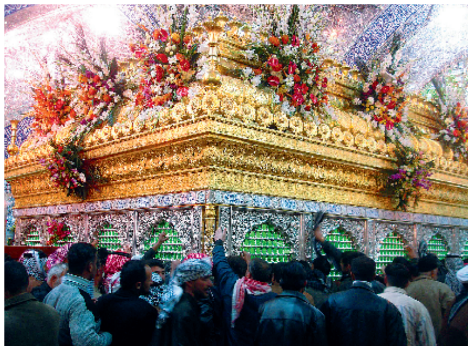
Visitors around Imam Ali's Mausoleum