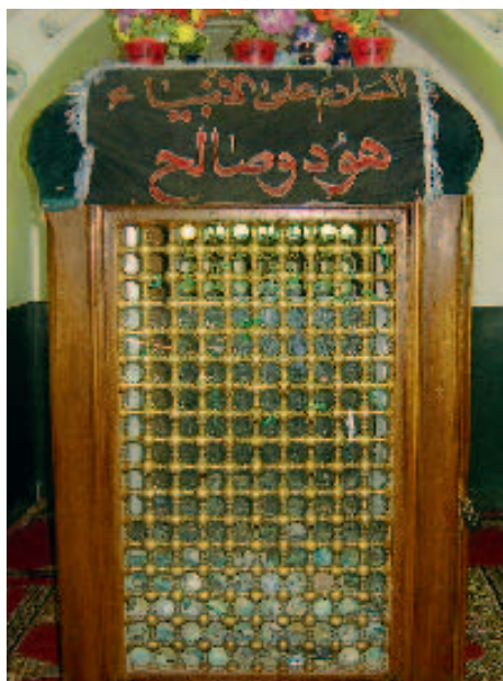
The mausoleums of Hod and Saleh