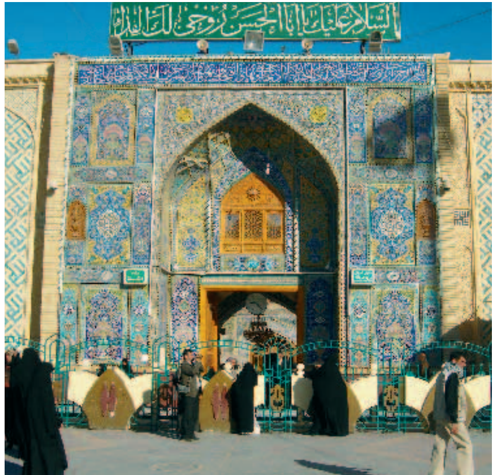
The Qibla gate

Najaf is privileged to host holy sites. It has a unique rich Islamic heritage. No wonder it was chosen as the city of Islamic Culture for 2012. ■