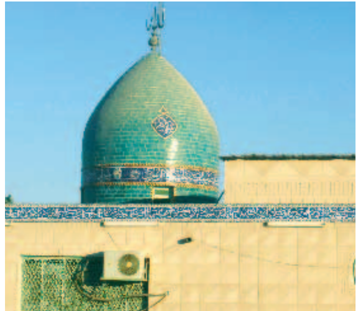
The shrines of Hod and Saleh قبة مرقد النبيين هود وصالح

into harm and transgression." Some historians indicated they ended up in India; others argued that they were sent to Arabia. Noah was sent by God to a people who engaged in practices that God hated: obscenity, idolatry, apostasy and drinking wine. They deviated from the path of God so much that they perished in the deluge, while Noah and his followers were saved thanks to the ark he was able to build with his hands. The bubbling of the oven was one of the signs of this flood. According to some accounts, this oven was Kufa, located only 8km of Najaf.