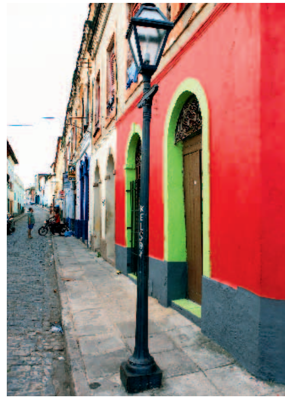
Sao Luis of Maranhao