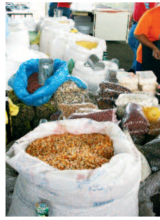
Brazilian beans and nuts