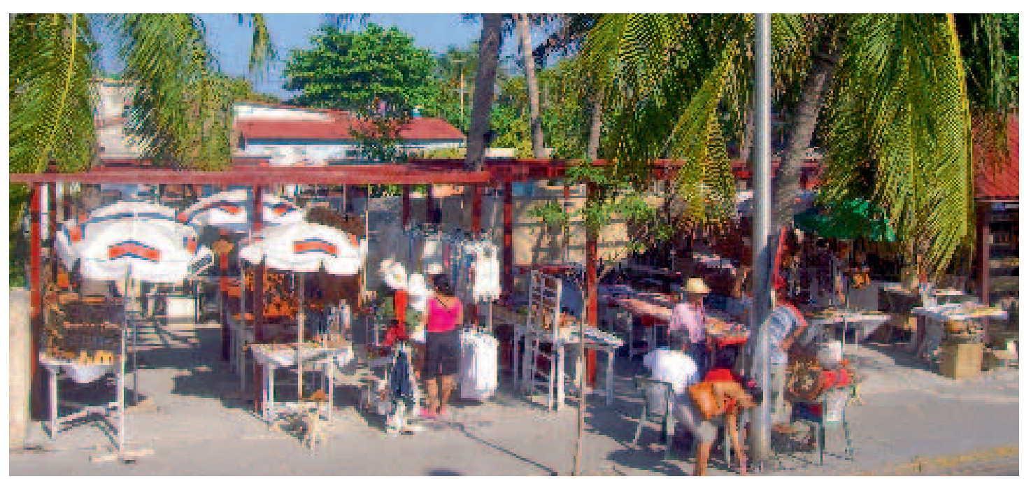
Market along the main street

The best way to see the country is to take the offered excursions. My favourites is: Guamá Sugar and history - see the sugarcane fields and a re-created Indian village - cost CUC59.00.