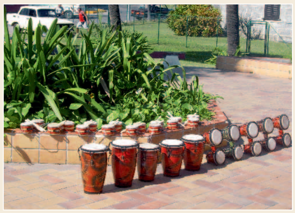
Drums in the market