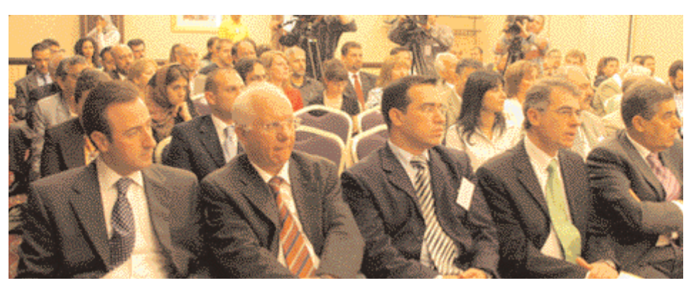
Some of the participants