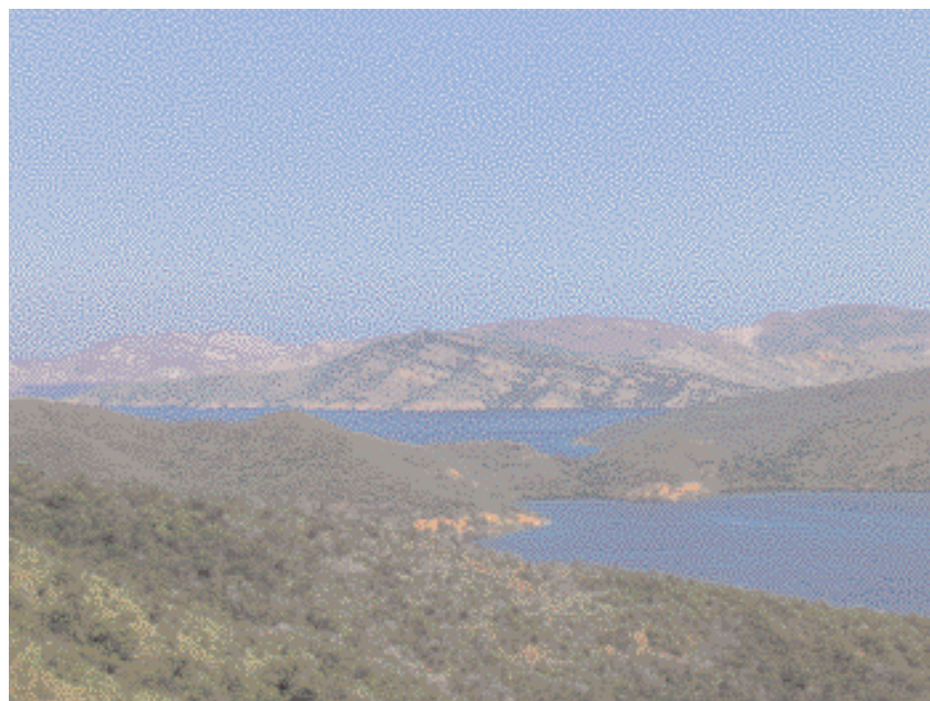
Mochima National Park