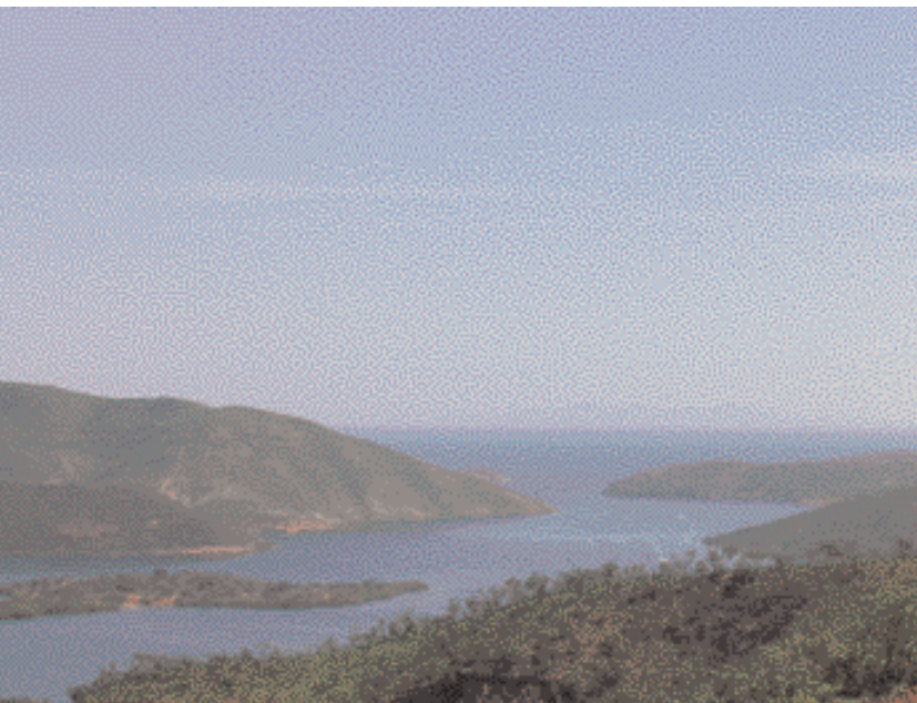
Mochima National Park