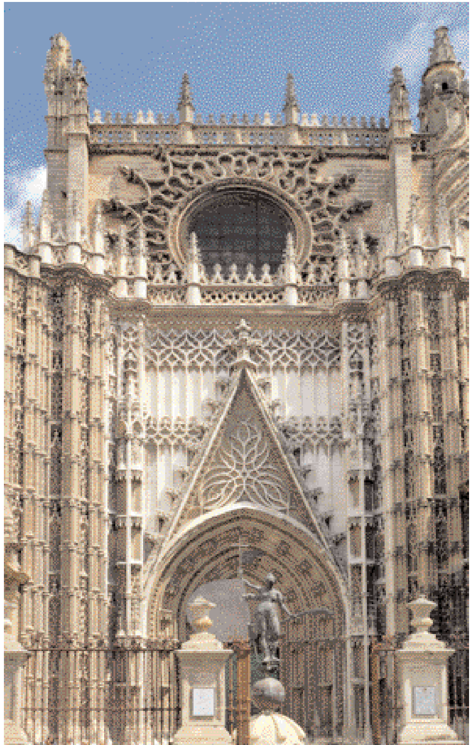
Iglesia de San Julian