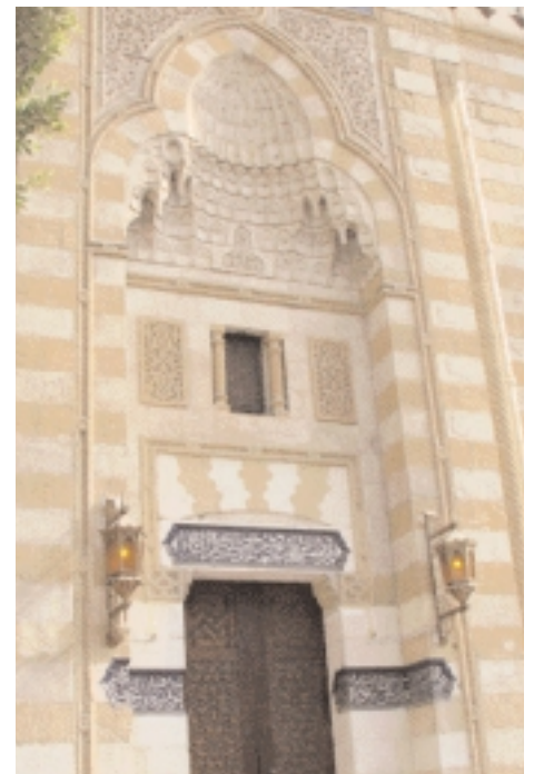
The mosque of Sayyida Sukaina

Sukaina was brought up under the guidance of her father Al Hussein. She learned the Koran, traditions of the prophet, and other religious teachings in this holy family. Her mother, Al-Rabab Bint Imria El-Qais, was a great lady, who witnessed the martyrdom of Al-Hussein, on the day of Kerbela, in 60 H. She was taken prisoner with the other members of Ahl Al-Bayt (the family of the Prophet) and then returned with them to Medina. When ▶