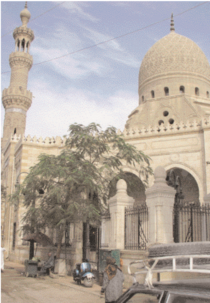
The mosque of Sayyida Sukaina