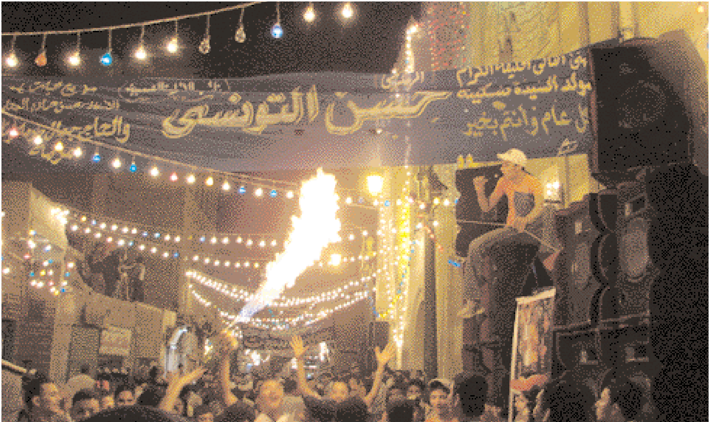
Celebration of Sayyida Sukaina