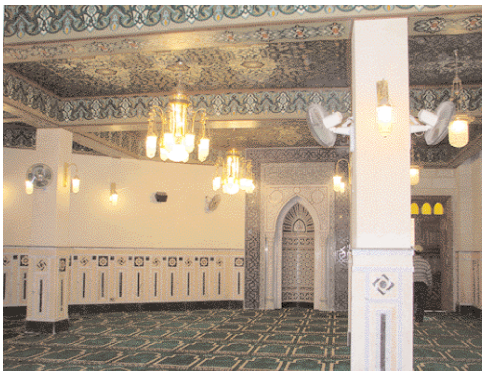
Inside the mosque