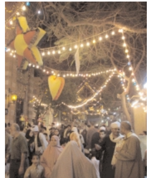
The birthday of Sayyida Sukaina