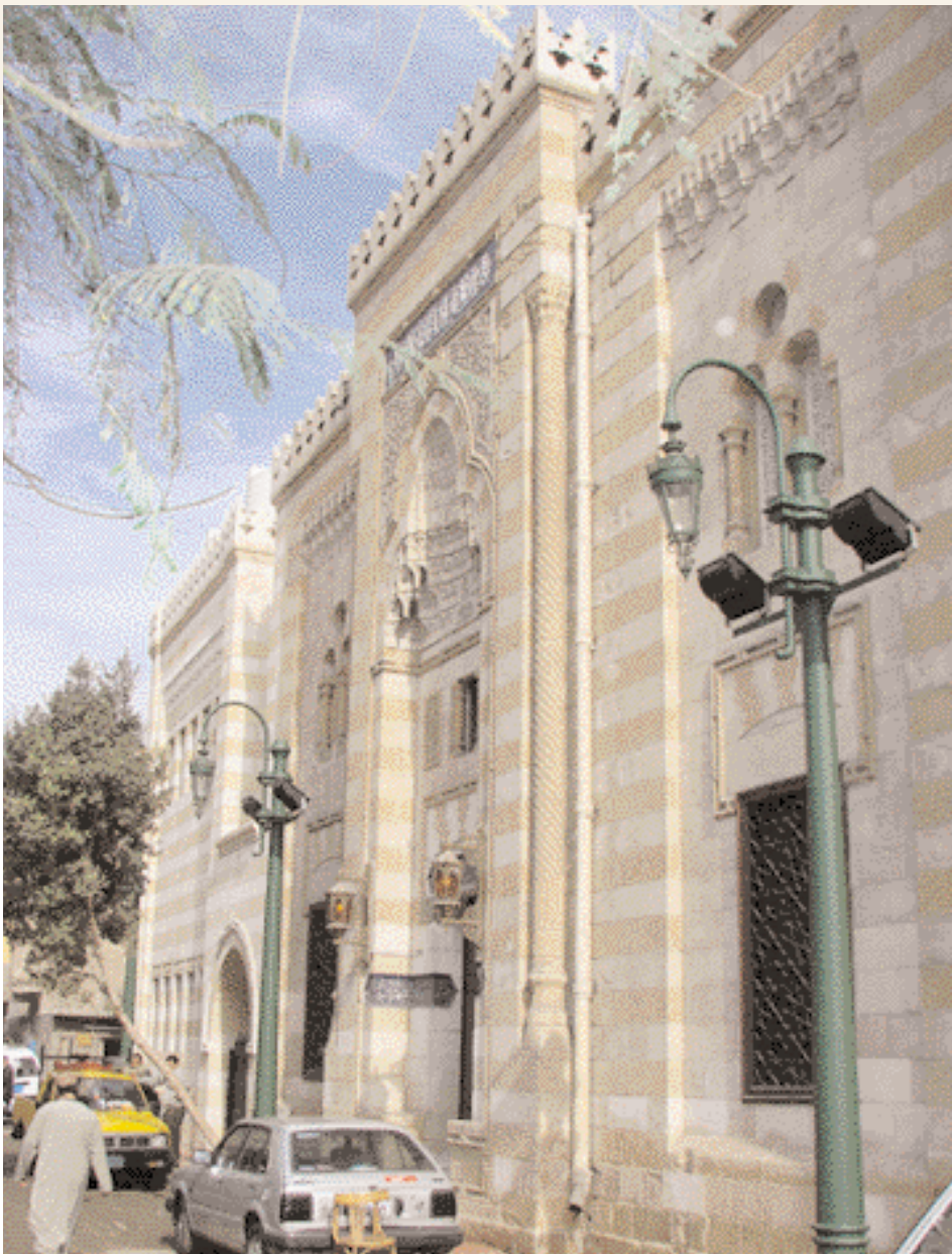
The mosque of Sayyida Sukaina

Sukaina, the daughter of Al Hussein Ben Ali Ben Abi Taleb, was born in the year 47 Hegira (H). Her mother was Al-Rabab Bint Imria El-Qais Ben Addi Al-Kalbi. Her father named her after his grandmother, Amina, mother of the Prophet Mohammed (Peace Be Upon Him) but her mother called her Sukaina, because she brought happiness to the family.