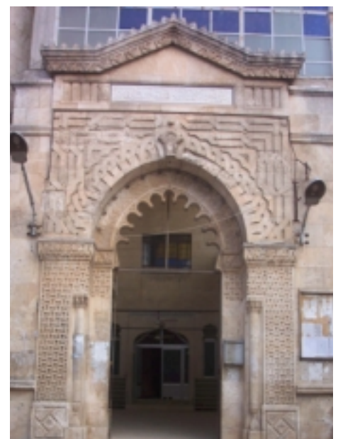
The minaret of the Grand Mosque in Takharim مدخل جامع كفر تخاريم