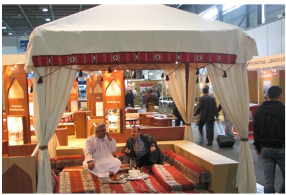
A traditional meeting at the stand of Oma