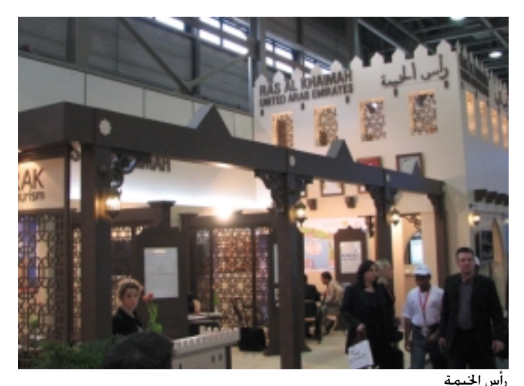
Ras Al Khaimah