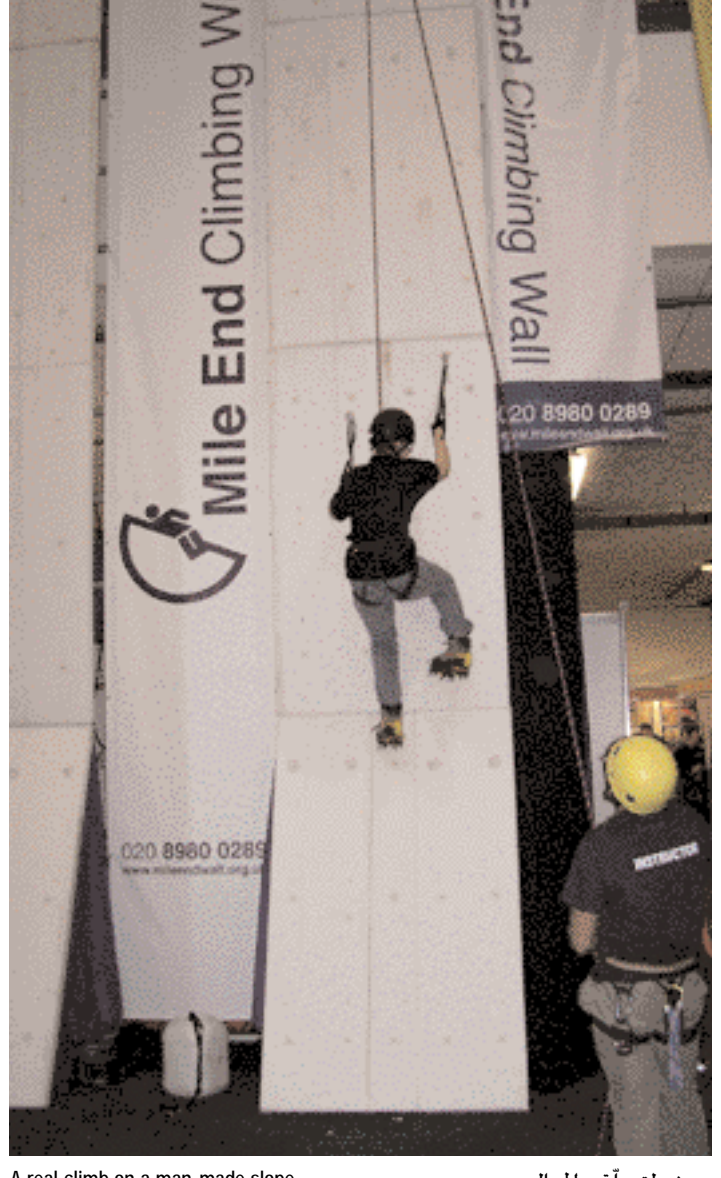
A real climb on a man-made slope