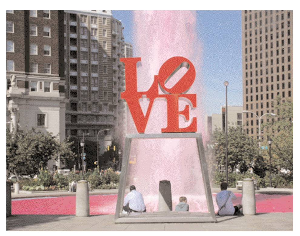
The Famous Love Sculpture

During the American Revolutionary War (1775 – 1783), also known as the American War of Independence, Philadelphia was the center of the American independence movement. The Declaration Independence and the US Constitution were signed in the city's Independence Hall. In 1790 the seat of the United States Government was moved from New York City to the Congress Hall in Philadelphia. For 10 years (1790 - 1800), the city was the temporarily capital of the new country. In 1800 the federal institutions were moved to the newly-established capital, Washington. Today, Philadelphia is a big modern city with more than 1.5 million inhabitants and the center of the fourth biggest metropolitan area in the USA with roughly 5.9 million