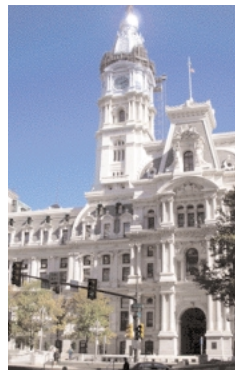
The City Hall

The city center is famous for its green Rittenhouse Square where luxurious hotels and boutiques, cafes and restaurants are clustered. Beside the cozy green squares all over the city, one of the world's largest