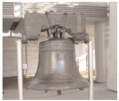
ناقوس الحرية الشهير The Famous Bell of Liberty

Beyond museums, parks and historical sites, the city offers beautiful neighborhoods of different sizes, lifestyles and atmosphere. The elegant Society Hill is an attractive mix of colonial homes and art galleries. The area around South Street is a concentration of funky and bohemian shops, music venues and eating places. The University City and