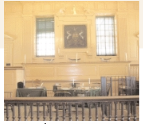
الغرفة التى وقع فيها الدستور The Room were the Constitution was signed

The Museum of Art with the Famous Stairs