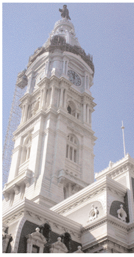
تمثال بين على قمة برج مبنى البلدية Penn Sculpture on the Top of the City Hall Tower

Philadelphia is more than a historic city that is proud of its spirit of tolerance, diversity and culture. During my short stay there, I gained the impression that Philadelphia has its own way of life that is different from the mainstream American way of life. In this context it joins such US cities as San Francisco and Chicago where the local specifics and particulars dominate over the general national character of American cities. This could be considered as further evidence of the diversity of modern USA.