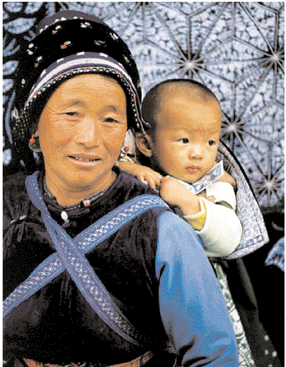
A mother and child from China's tribal area

Yet history, more than 5,000 years of it, remains the heart and soul of Beijing. Within walking distance from my hotel was the Forbidden City, the largest ancient palatial structure in the world where