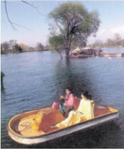
Ayub Nation Park متنزه أيوب الوطني في راولبندی