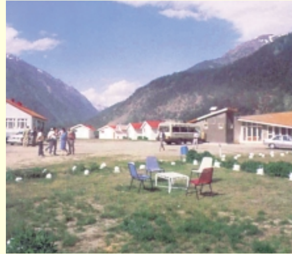
A motel at Kalam, Swat بيت للسياح في كلم، سوات

The botanist can spend hours happily searching the forest, ravines clothed in ferns and mosses for flowers and plants normally seen only in specialist garden centres. One hour's drive from the capital city of Islamabad, the Murree Hills, geologically part of the Western Himalayas, offer the naturalist a wide variety of habitats from dense pine forests bisected by tumbling streams, the home of Whistling Thrushes and River Chats, to alpine meadows frequently swept by low cloud driven up valleys that stretch like fingers in all directions. Numerous paths cross and re-cross the hillsides linking one hill resort with another small motels cater adequately for the visitor.