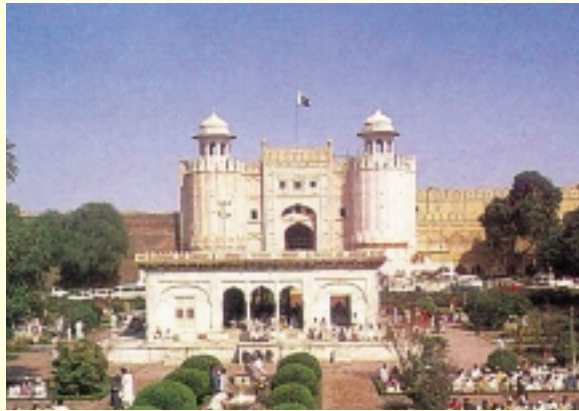
Royal Fort, Lahore

This is a region of the world which is open to the experienced trekker and