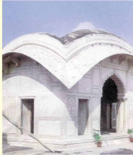
Naulakha Pavilion, Lahore قبة نولاخا في قلعة لاهور