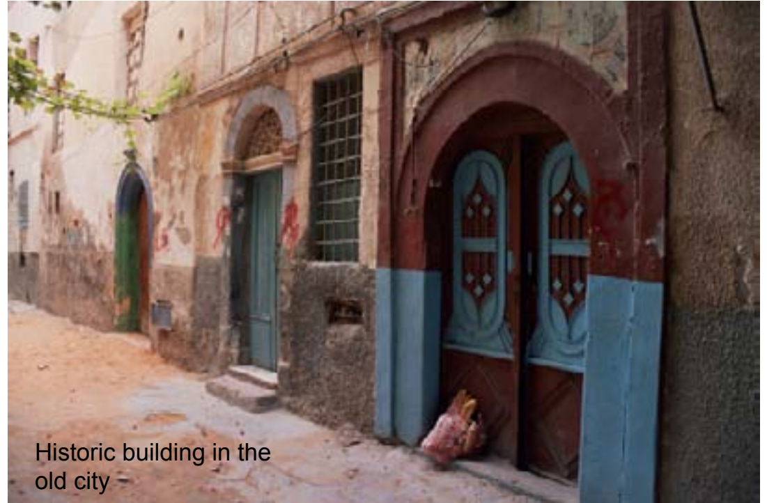
Historic building in the old city