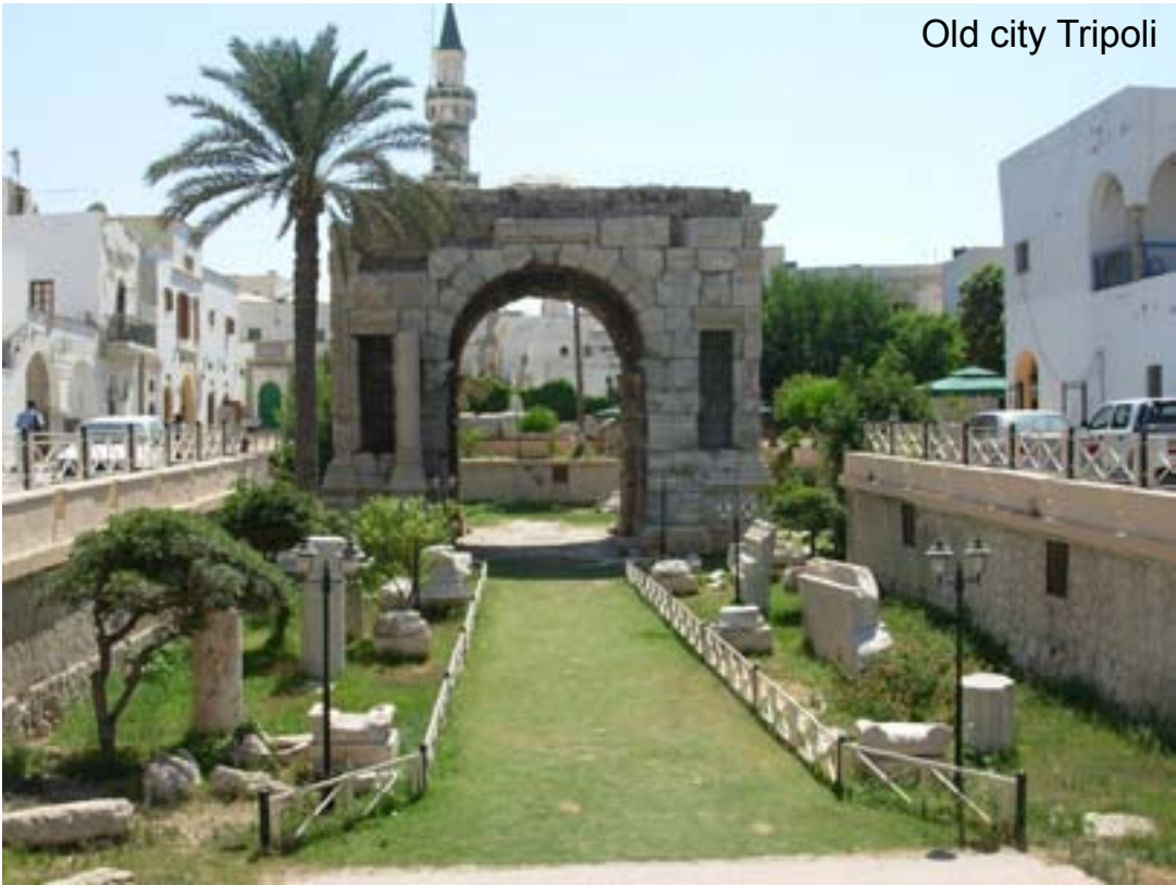
Old city Tripoli