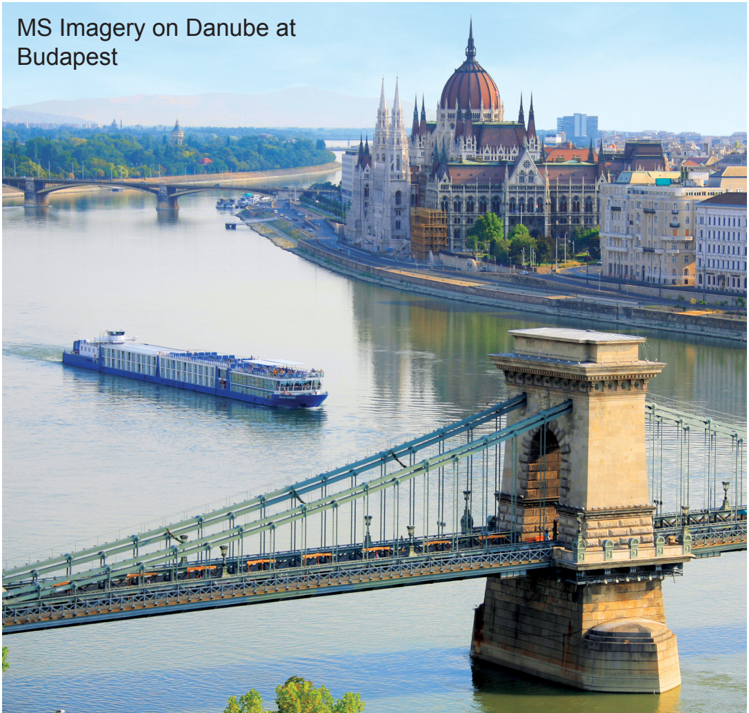
MS Imagery on Danube at Budapest

A magnificent thousand-foot stone bridge spans the Danube in the old section, and nearby is Germany's oldest restaurant, Alte Wurstkuche (Old Sausage House). We had a plate of its famous bratwurst with a side of sauerkraut.