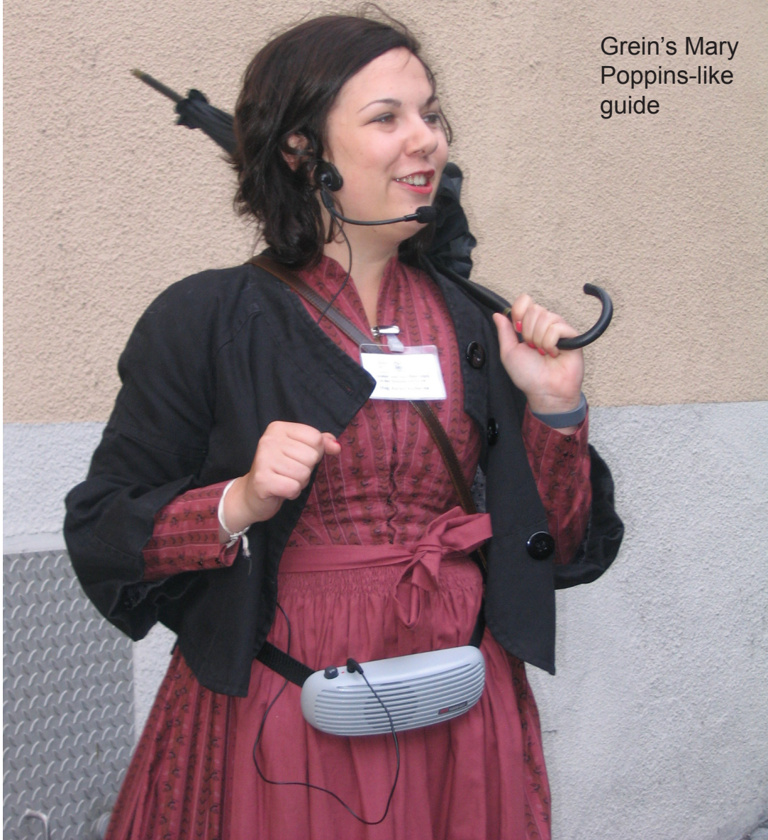
Grein's Mary Poppins-like guide

Today, the theater is used for travelling theater groups and local