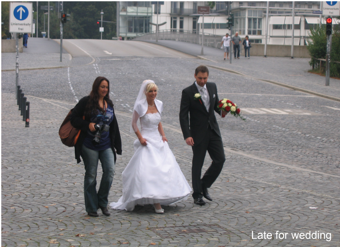
Late for wedding