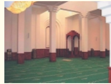
Inside the Mosque

Before the existence of the Central Mosque building, Muslims prayed in a small flat. But in the 1980s, a plot of land was bought from the city council, on the condition that the existing building there, which was over two hundred years old, should remain and be utilised.