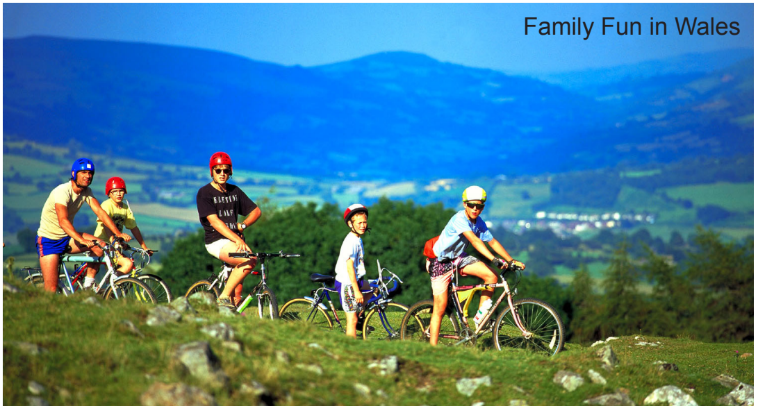
Family Fun in Wales

For more information please visit www.visitwales.com .