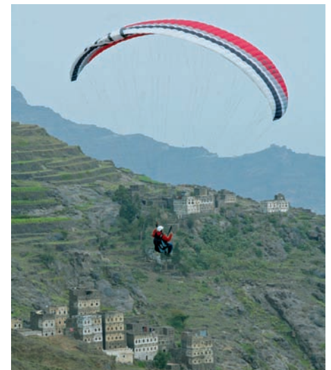
Freedom of the skies

traditional festivals and hear about Bedouin customs including their legendary hospitality. There are also endless stories about the love of desert life despite the harsh conditions. Mountain climbing can start with the Haraz mountains covered with greenery, from an altitude of 2200m. They are found 115 km from the capital Sana'a. This is a real paradise for lovers of hiking. From the summit, one can observe a multitude of Yemeni villages with their unique traditional architecture: they are like fortresses surrounded by beautiful agricultural fields. Fans of scuba diving, can find beautiful coral, fish and turtles. Unique Dragon's Blood trees and migratory birds, are on the magical island of Socotora. ■