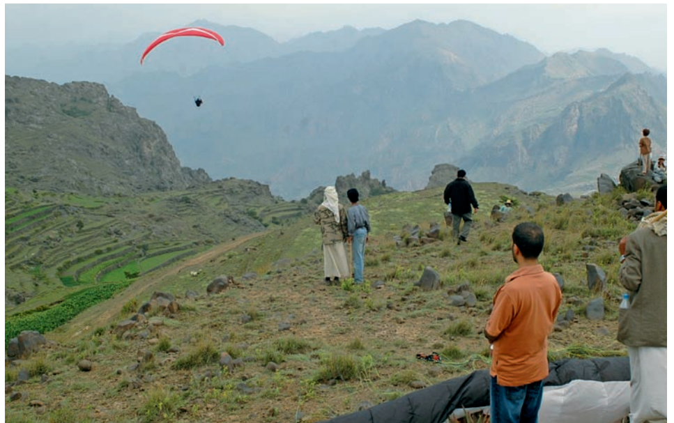
The friendly locals watching the flight