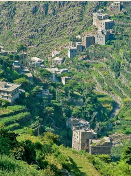
Villages on the slope

Yemen has huge potential in the field of adventure tourism, including large natural assets. This is not exaggeration or disinformation but a dream that has actually materialized.