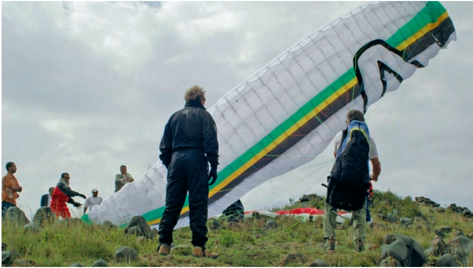
Many helping hands