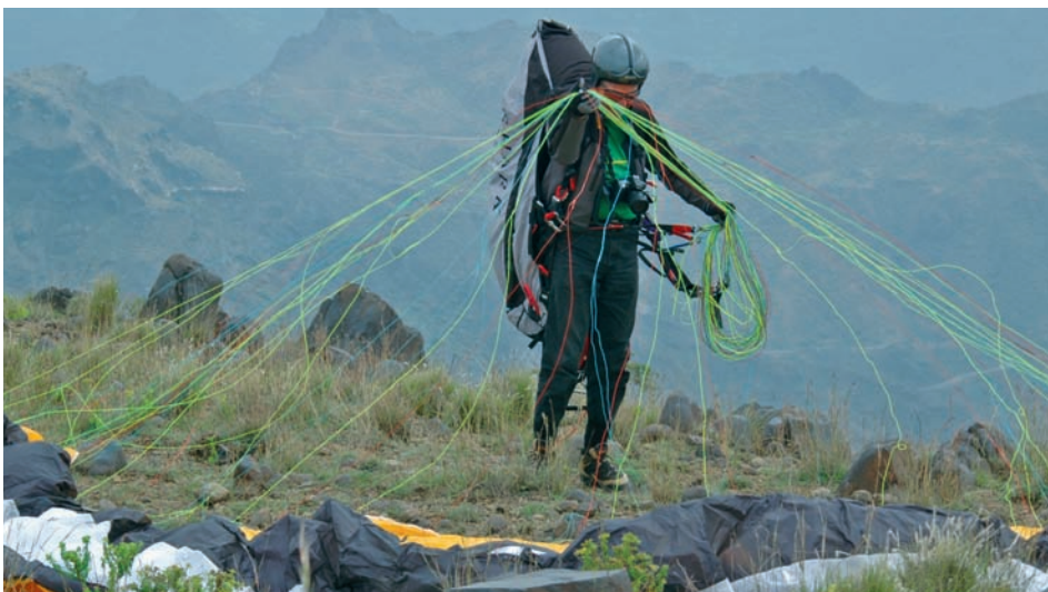
All went well