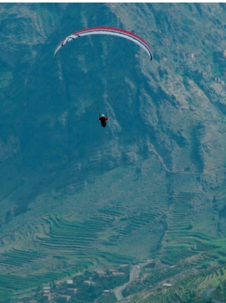
Enjoying the flight

Yemen's Ministry of Tourism is paving the way for investors from various nationalities to invest in the tourism sector, which is beginning to see noticeable growth and prosperity, as evidenced by the increase in the number of visitors to this great country. The New York Times reported that Yemen was chosen as the best tourist destination in ▶