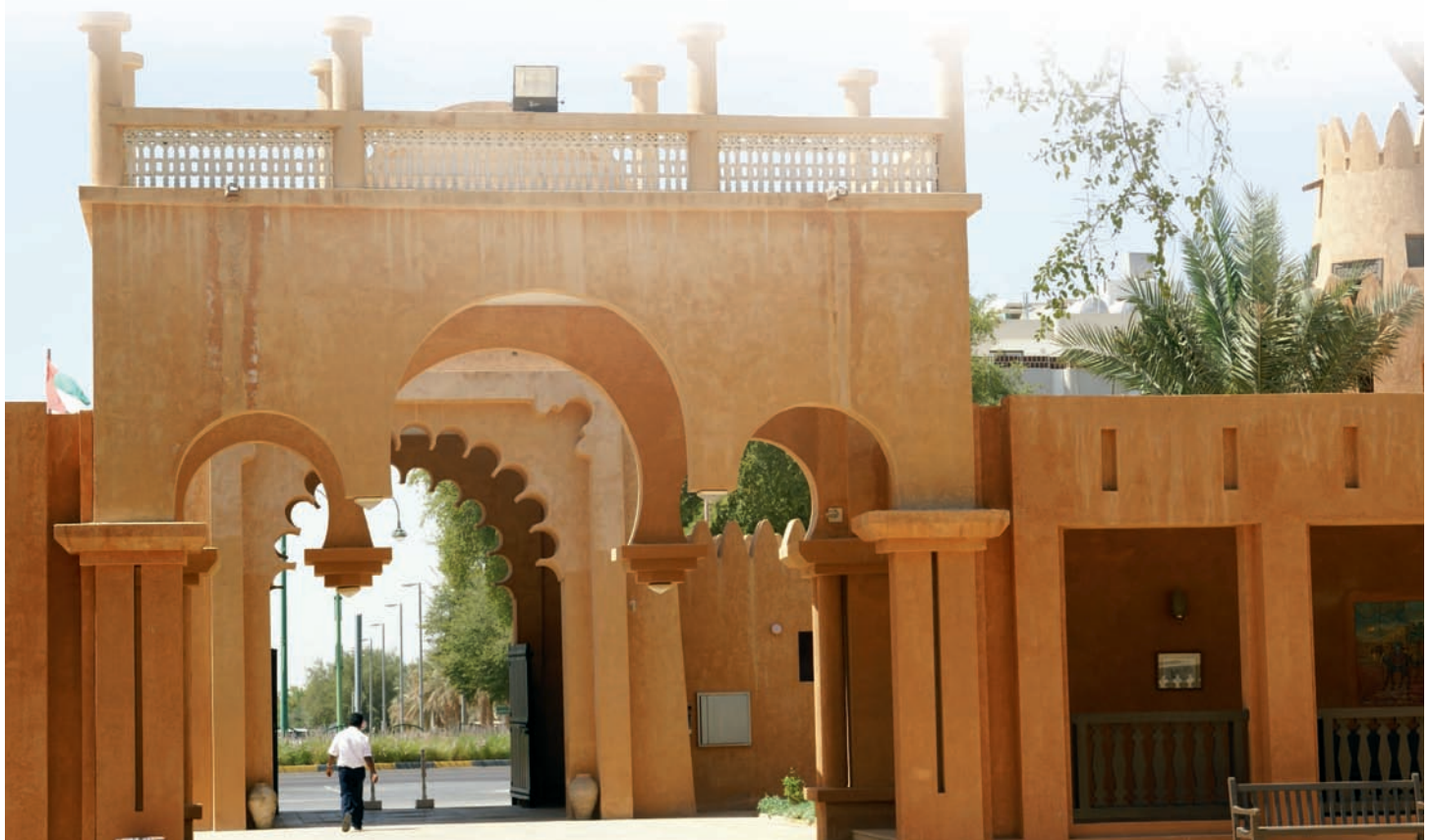
Al Ain Palace

hall and the Marina Mall, a large air conditioned shopping mall with boutiques, supermarket, restaurants and cinemas. Despite recent rapid growth the long history of traditional old world hospitality and friendliness to visitors remains. Facilities for children in hotels, public parks and