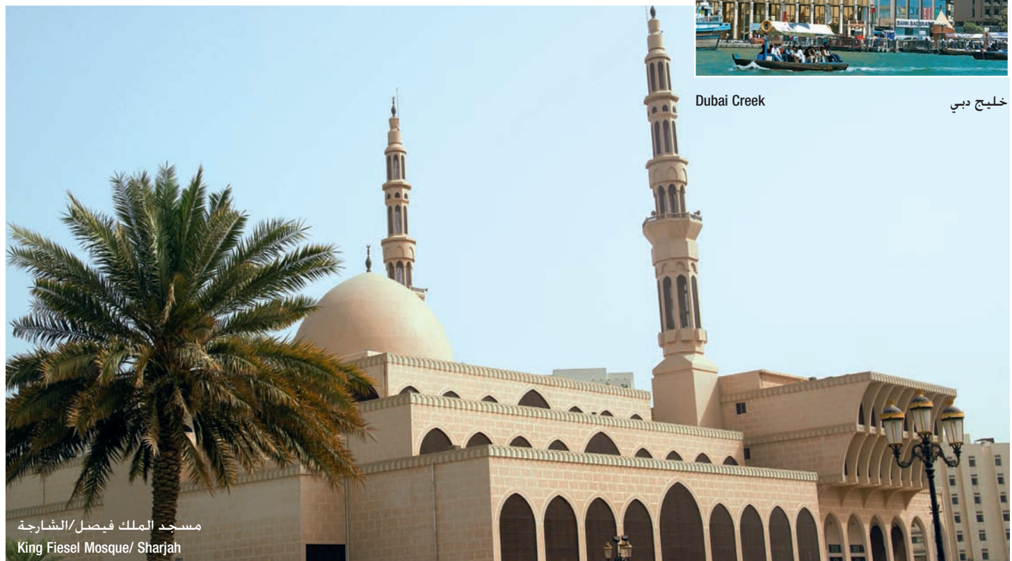
مسجد الملك فيصل/الشارجة King Fiesel Mosque/ Sharjah