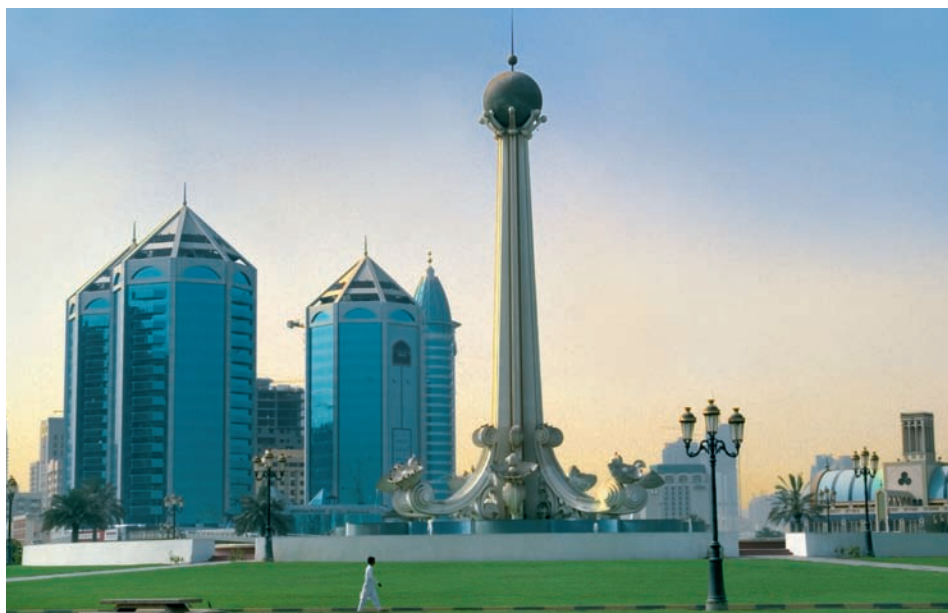
Unification of Emirates Monument