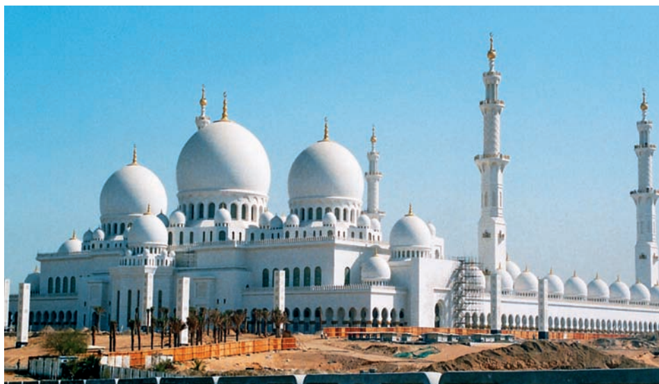
Sheikh Zayed Mosque/Abu Dhabi

I took the whole day excursion to Al Ain, travelling on the new desert motorway with irrigated farm land on both sides. The backdrop of rugged mountains forms the boundary with Oman. There is a long history. The abundance of water