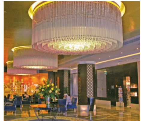
Hilton Hotel/Abu Dhabi فندق الهلтон/ أبو ظبي

Abu Dhabi Tourism www.abudhabitourism.ae Orient Tours localsales@orienttours.a/c