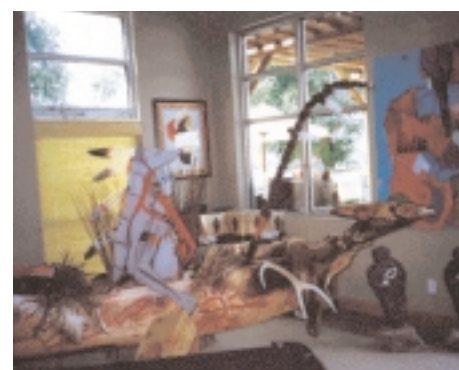
معروضات حرفية في مركز الصحراء والتراث Craft display at the Nk'Mip Desert & Heritage Centre.

traditions. There are cultural demonstrations and high quality native art and artifacts displayed like museum pieces in the tastefully designed building. Osoyoos also has one of the warmest lakes in Canada with sandy beaches and a grassy bank ideal for picnics. The displays in the modest museum focus on the natural and local history, orchards and irrigation. ■