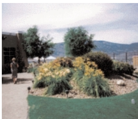
Nk'Mip Desert & Heritage Centre. مركز الصحراء والتراث