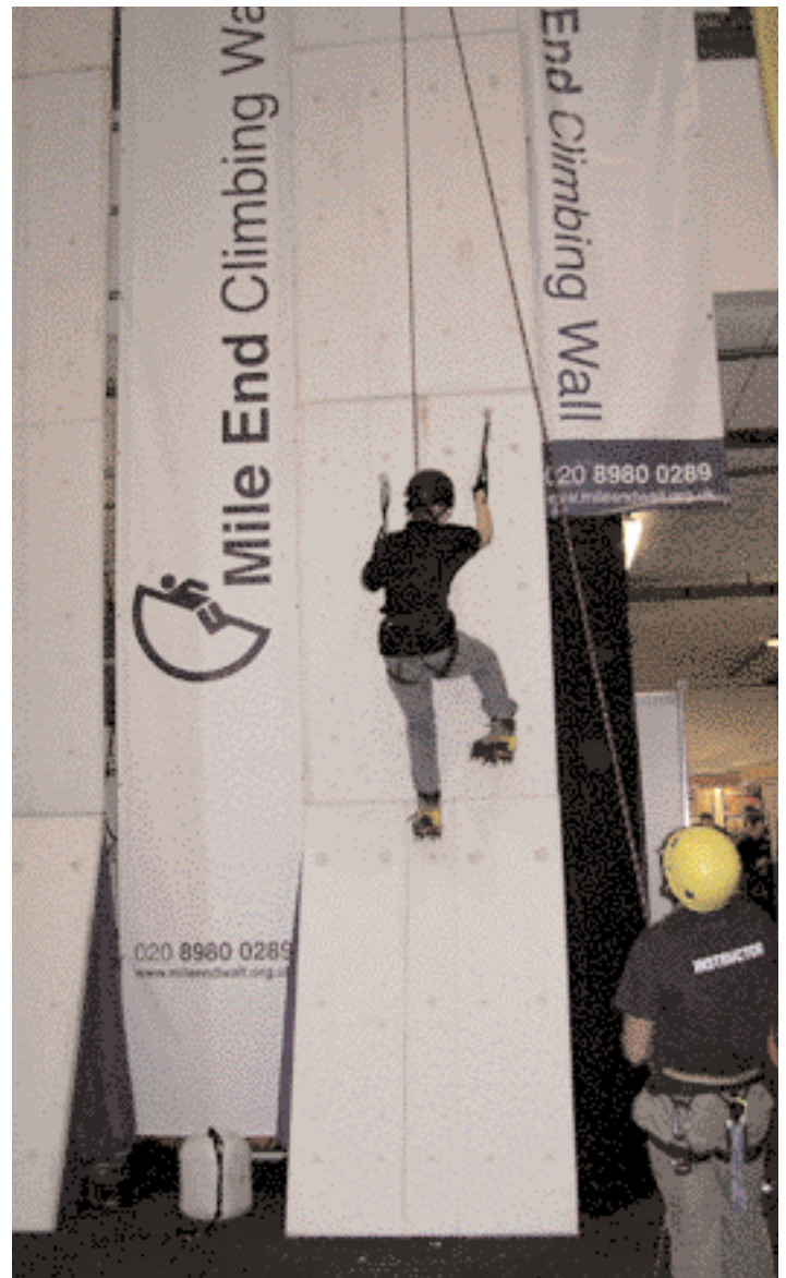
A real climb on a man-made slope