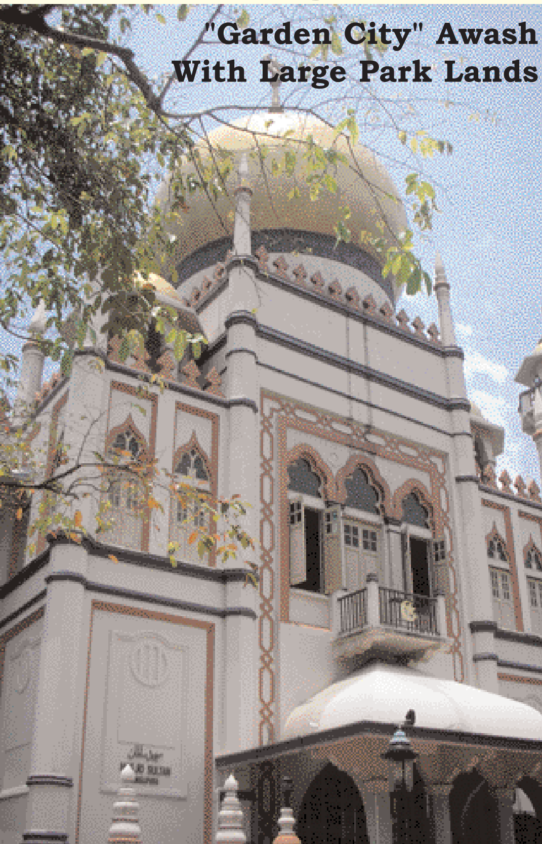
The Sultan Mosque