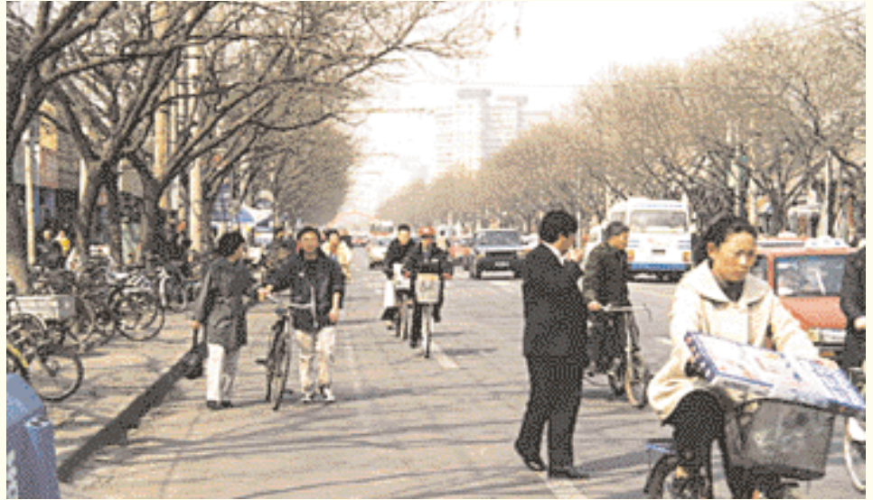
Daily life in Beijing

Beijing is undoubtedly one of the world's shopping paradises, with distinguished shopping centers and diversified goods. All hotel reception desks can supply a list of shopping centres including the famous silk market: six floors, each one specialized in certain types of goods. Even if you do not want to shop there, it is worth a visit to see the infinite range of cotton fabrics for all the family, 70% cheaper than anywhere else. However, shopping in this market requires great bargaining skills and product knowledge. On other floors, one finds accessories and valuable, beautifully-coloured stones with splendid designs. There are also famous Chinese silk fabrics decorated with bewitching drawings and colors, as well as antiques and ceramics. The stores, with simple folding screens, are open from 8 a.m. to 10 p.m. The shopkeepers are not concerned about theft - Beijing is a city where safety reigns. And security men are on hand after the shops have closed.