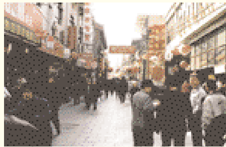
Shopping in Beijing