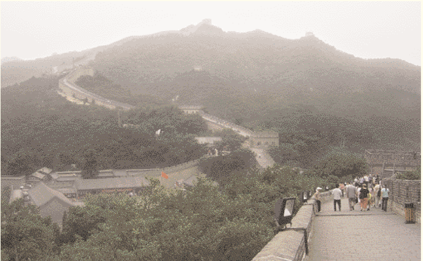
The Great Wall: general view

Beijing is not only the capital of one of the great powers of our time: it is a city which confirmed its greatness for thousands of years. Its historic sites require a whole book. It is with emotion that one could talk about the Forbidden City, the palaces of kings and emperors, such as the famous Summer Palace, the old historical temples, such as the Temple of Paradise, the old city, or the museums and shopping centers. A minimum of five days is required to see these sites but due to my participation in the Beijing International Tourism Exhibition, I could visit only the Great Wall of China and certain shopping centers.