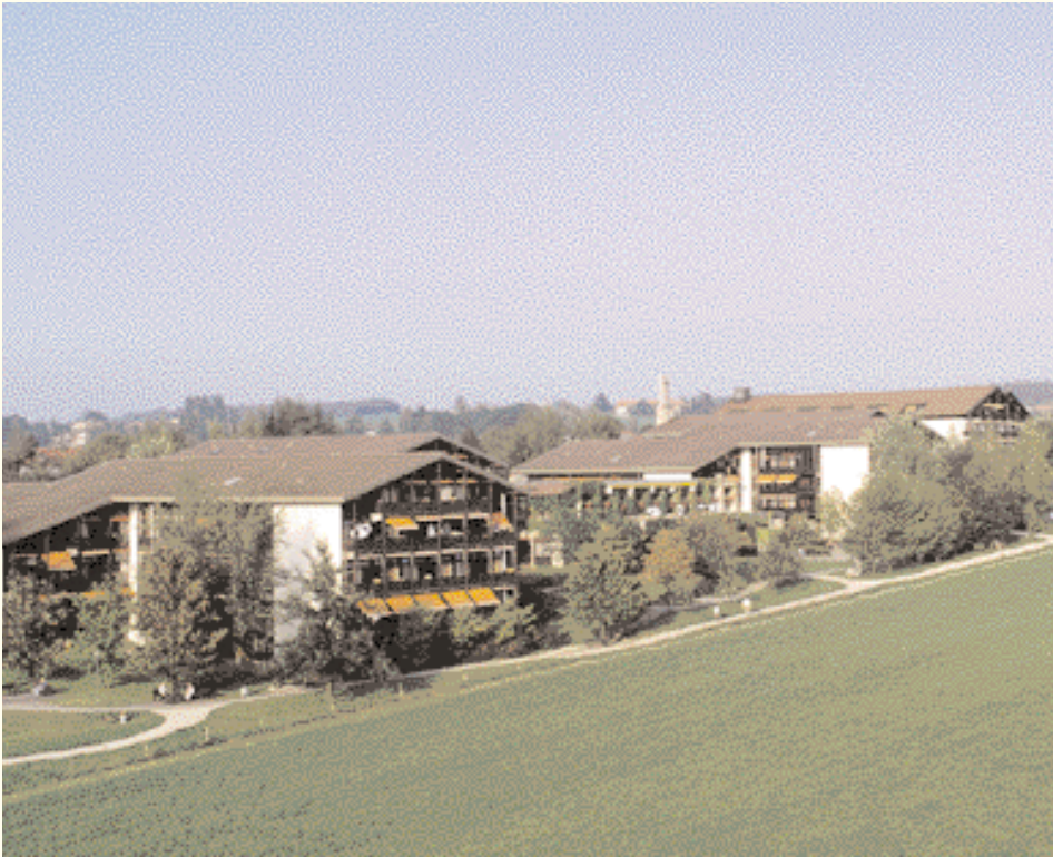
The Simssee Klinik in south Bavaria