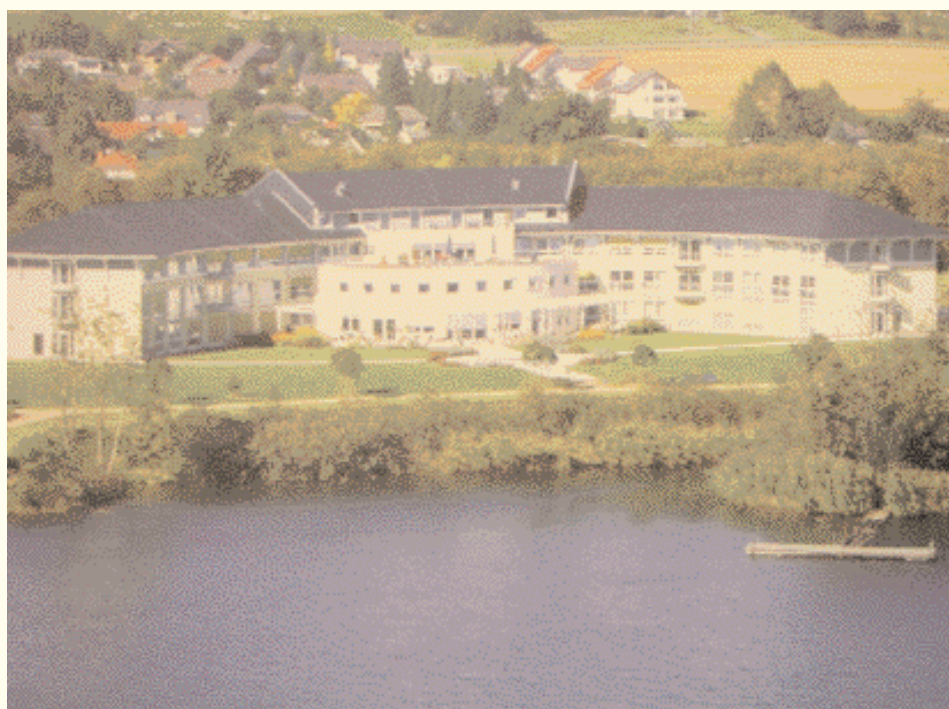
Medias Clinic in Ransgach-Baumbach

The United States of America used to attract many Arab medical tourists, especially from Arab Gulf countries. The situation changed dramatically after the terror attacks in New York in 2001. Visa restrictions sometimes accompanied by anti-Arab and anti-Muslim rhetoric and attitudes strongly affected the number of Arab tourists. Observers estimate that turnover in American healthcare dropped in 2002 and 2003 by about fifty percent from a previous $1.4 billion in 2000. That means that treatments worth up to $700 million annually were either not carried out or re-located outside the USA. The facts