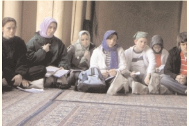
In Bin-Toloun Mosque in Cairo.