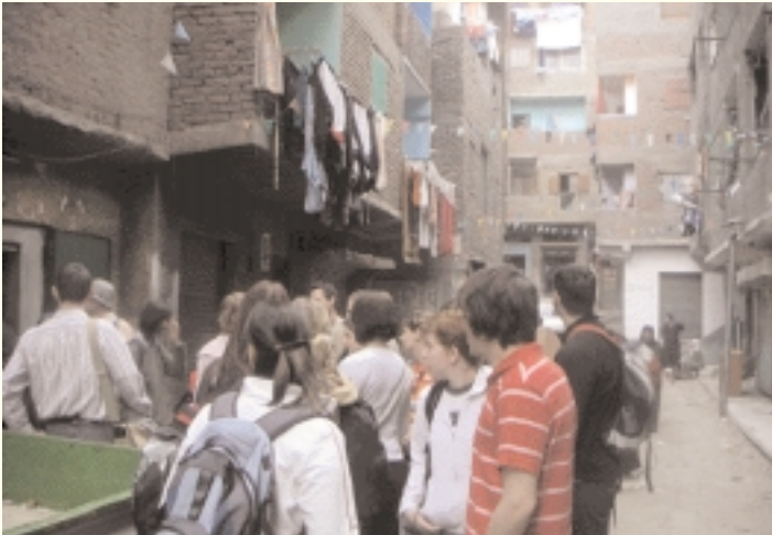
In Manshyet Naser.

الباخرة سسودان التي صورت عليها قصة أغانا كريستي "وفاة عند النيل".