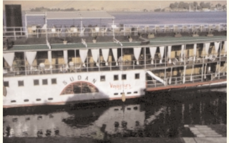
The Famous Boat Sudan Where Agatha Chisti's Death on the Nile Played.

الباخرة سسودان التي صورت عليها قصة أغانا كريستي "وفاة عند النيل".