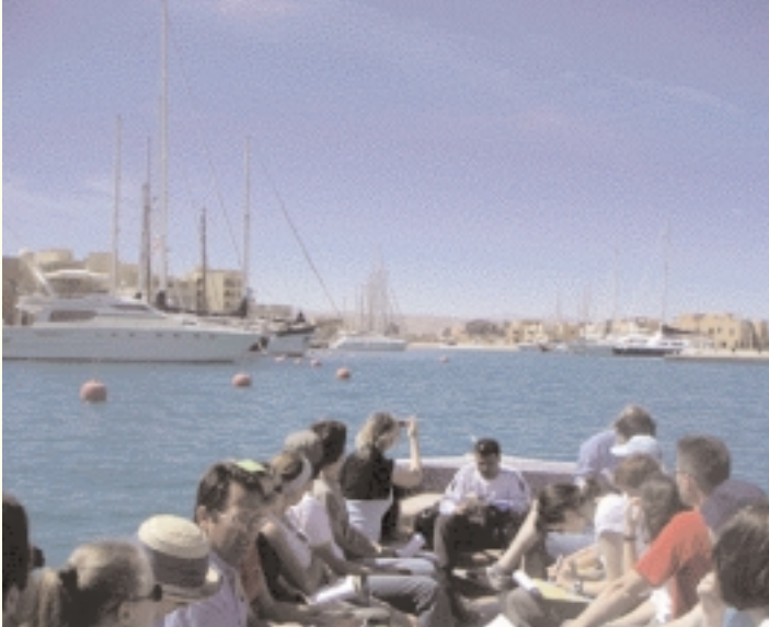
The Marina in Elgouna.