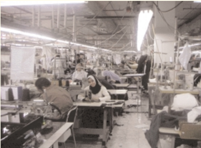
The Textile Fabric of BTM.