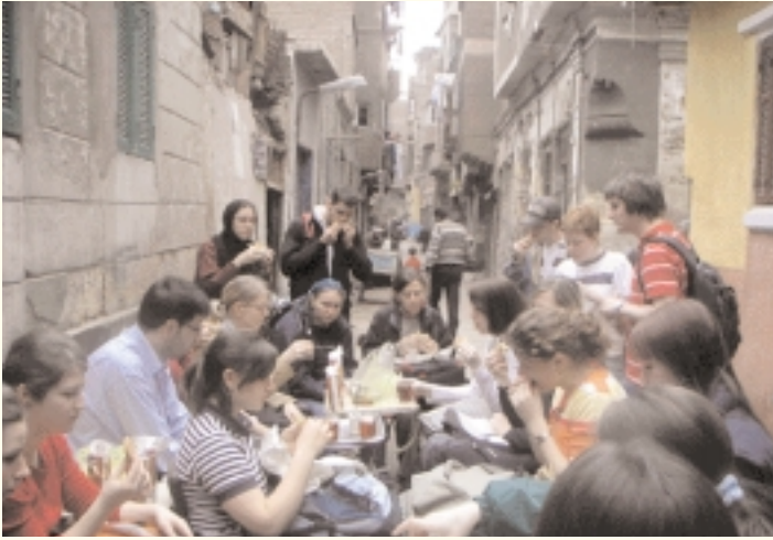
Tea and Falafel in a street cafe in el-Gamalya.