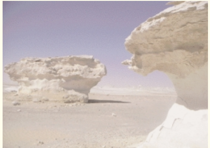
The White Desert.