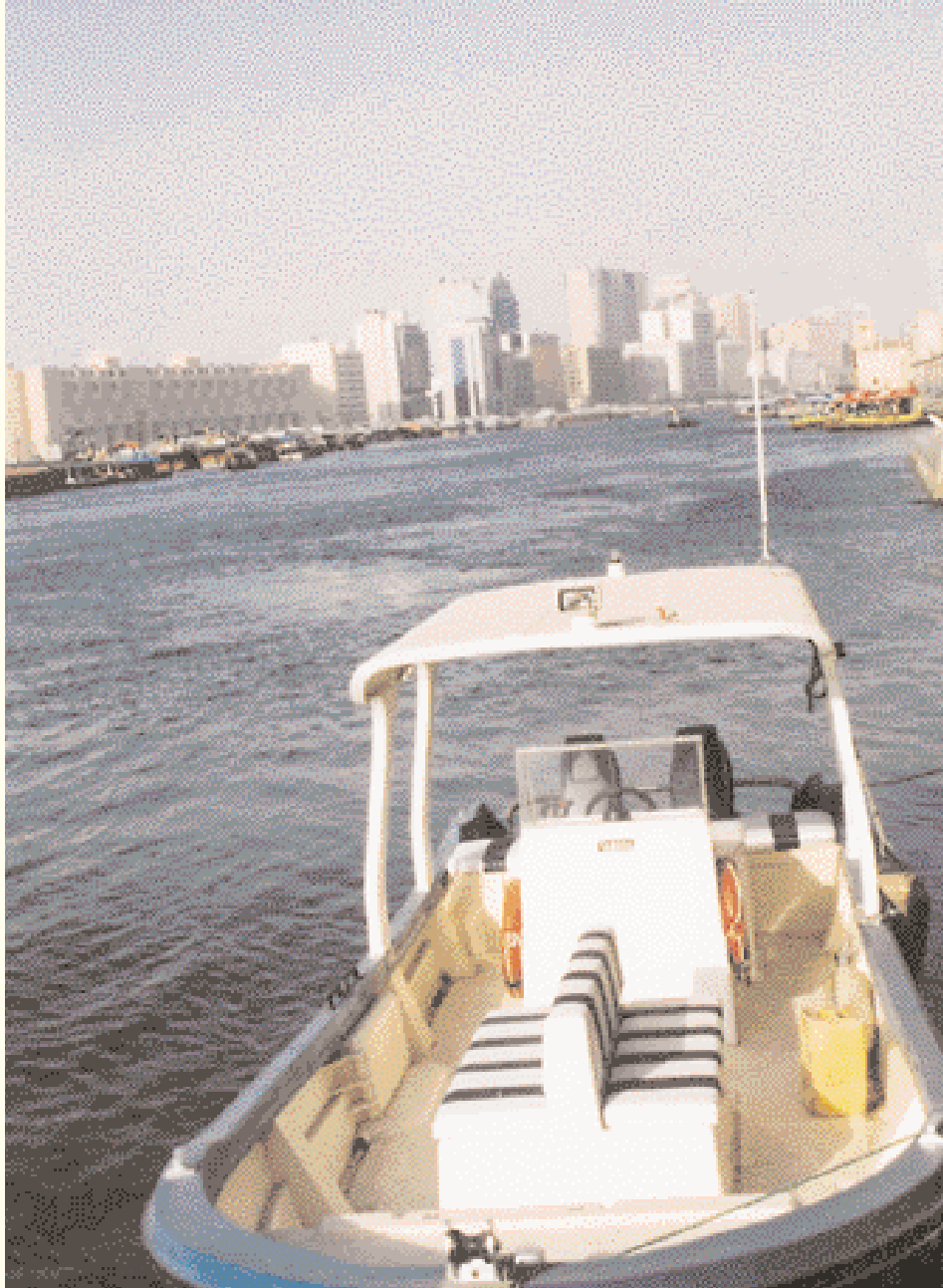
A view of Dubai's downtown core from the water.

Dubai attracts about five million visitors a year, but relatively few North Americans.. Most are from Britain, Germany and Russia on the European continent, along with residents from African and Asian countries. They come for the sunshine practically guaranteed year-round with little rain (although June through September can be uncomfortably humid), for the world-