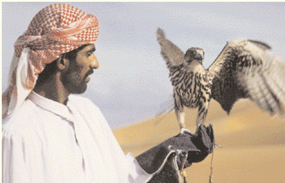
The falcon, a prized bird in the United Arab Emirates.

The Burj Al Arab is shaped like a sailboat and stands on a man-made island in the Arabian Gulf, linked to the mainland by a causeway. It is taller than the Eiffel Tower and only a little shorter than the Empire State Building. The sail façade features a double-skinned Teflon-coated woven glass fiber screen. A dazzling white by day, it becomes a canvas for a rainbow of spectacular light displays at night. Wherever you are in Dubai, you can't miss it. Suite rates range from about $300 to $10,000 a night.