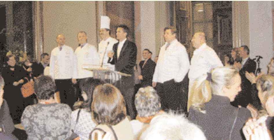
Honouring the cooks